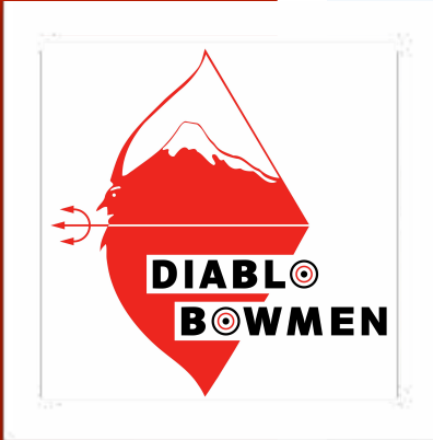
Diablo Bowmen at the East Bay Scottish Association Tartan Faire