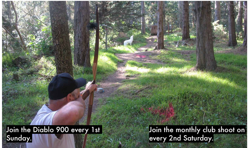
Join the Diablo 900 every 1st Sunday.