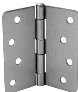
RPB74040-58 RPB74040-14 (Shown)