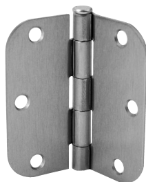
RPB73535-58 (Shown) RPB73535-14