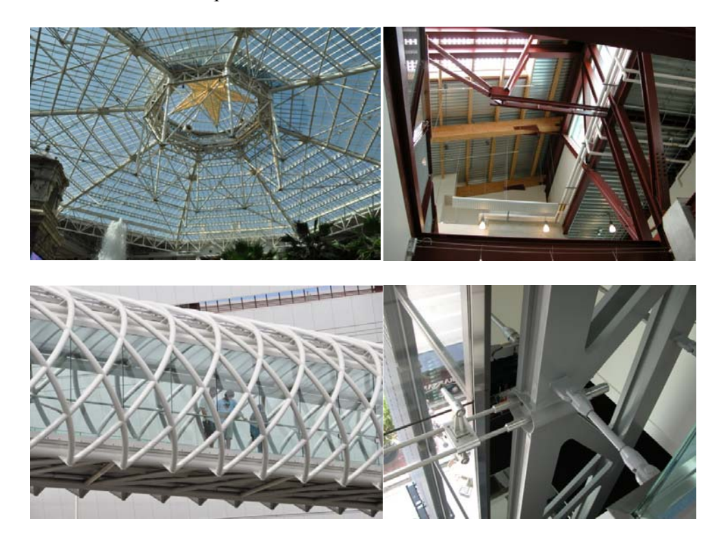
Fig. 3: The AESS Categories: (top left) AESS 1, (top right) AESS 2, (bottom left) AESS 3, bottom right (AESS 4). AESS 1 and 2 are located beyond 6 meters where AESS 3 and 4 are within view range and touch.

AESS 2 - Feature Elements includes structure or "feature elements" that are intended to be viewed at a distance > 6m (18ft). This distance reflects the height of a high ceiling and is considered adequately out of visual range to appreciate finer finishes and also beyond touching. The process requires basically good fabrication practices with enhanced treatment of welds, connection and fabrication details, tighter tolerances for gaps, and copes. This type of AESS might be found in retail and architectural applications where a low to moderate cost premium in the range of 40% to 100% over the cost of Standard Structural Steel would be expected.