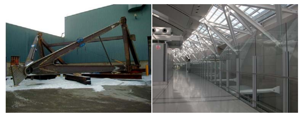
Fig. 4: The element at the left was the visual sample for the project. Given its size and expense, it was incorporated into the finished building. To find it on the right is akin to "Where's Waldo". Hence a cost and time saving that was worthwhile.

Worth noting is Characteristic 2.1, Visual Samples. These are common requirements for many projects when it comes to agreeing to specify finish materials and a potential problem for any AESS project as a full scale mock-up costs both time and money. Mock-ups are usually scrutinized very closely, at distances that are often much closer than in use. As the AESS in the project has become a critical element of the design and its finish is important, it is not surprising that architects and clients would like to see a sample prior to committing for the entire project. This characteristic highlights a variety of ways to satisfy this "need". It suggests alternate approaches that will save time and money. If a fabricator has experience in AESS other completed work can serve as the sample for the particular details in question will be designed. Partial mock-ups of welded connections can be created to allow the architect and client to make a selection, without requiring the fabrication of a complete piece. In one instance where a very large unique element was required, it was actually incorporated into the final project although its finer details were different than the dozens of elements created for the project.