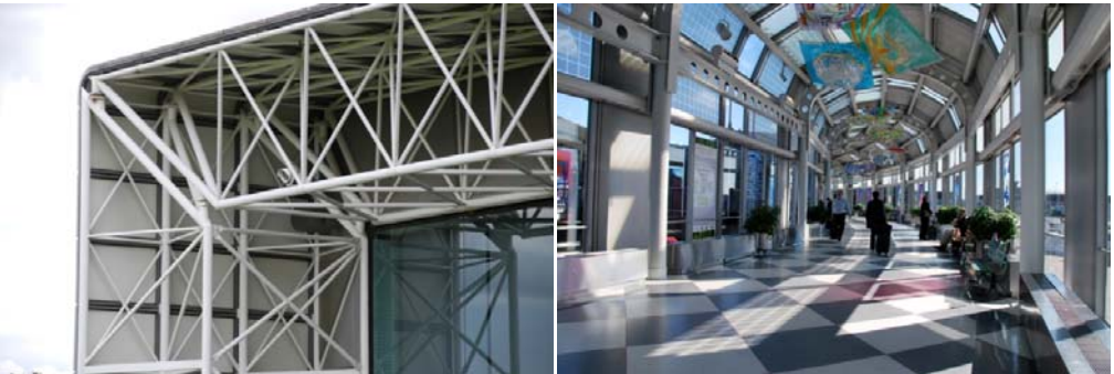
Fig. 1: Sainsbury Center by Foster (left) versus O'Hare International Airport by Murphy/Jahn (right). Sainsbury is rigorously modular where O'Hare begins to make more flexible use of a family of connection details.

Hollow structural sections (HSS) only came into significant production in the late 1970s. They were immediately incorporated into High Tech buildings, and innovative connection design followed. The widespread use of HSS truly began to differentiate the exposed steel architecture of the late 70s and onward from that of the Modern Movement which had used a limited palette of wide flange, channel and angle type sections. Standard structural steel sections did not really lend themselves to expression in the newly expressed hinge and pin connections while HSS seemed well poised to encourage innovation in the same.