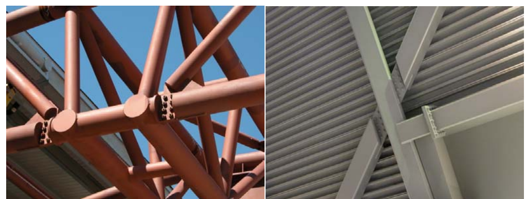
Fig 5: These two images show three variations in creating bolted connections that work in conjunction with welded members. The simple plates bolted to the ends of the square HSS on the right are less streamlined but the splice plates can be more discreet.

If the desire is for an all-welded look, decisions will get more complex as the shipping limitations will come into play. Larger elements will need to be broken into smaller pieces for transportation purposes. The team needs to clearly understand the route from the fabrication shop to the site, bridge and road clearances and how much "police escort" is to be afforded. Discreet or hidden bolted connections can be used as an alternate to a fully welded solution. Again the AESS documents and visual references in the Guide will assist the team by providing some suggestions for consideration.