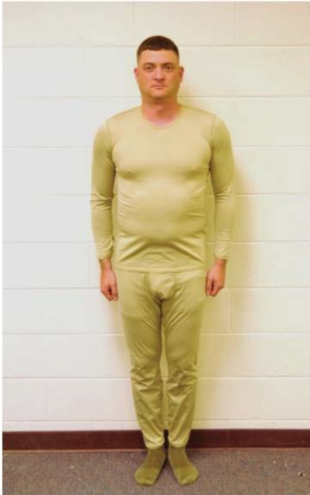
(a) Level 1: Light-weight Cold Weather Undershirt and Drawers. Use as a base layer next to skin. Silk-weight material is designed to transfer moisture from the skin to the outside of fabric where it spreads rapidly for quicker evaporation.