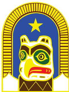
Figure 2. United States Army Distinctive Insignia

Description. A gold metal and enamel device that is 13/16 of an inch in height overall, consisting of a blue (ultramarine), enamel background, arched at the top and bearing a five-pointed gold star, the field bordered by a band of gold rays (each beveled), in the base two, white, enamel mountain peaks (one on each side), in the center issuing from the base the crest of a totem pole consisting of an eagle's head in proper colors facing to the right. The device is shown in Figure 2.