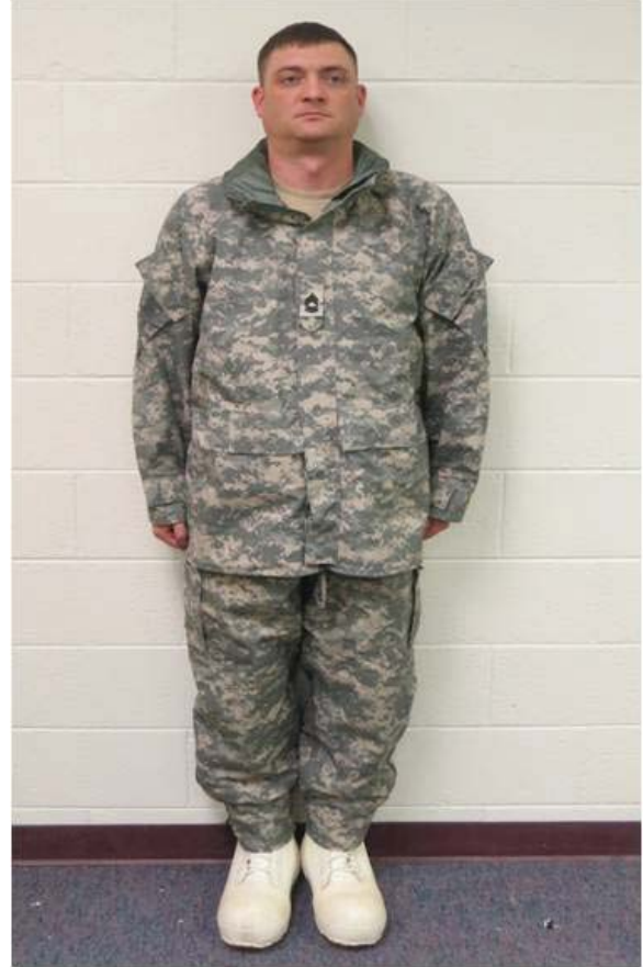
(f) Level 6: Extreme Cold/Wet Weather Jacket and Trousers. Wear as the outer shell layer when the average temperature is below 10° F. This is an authorized garrison outer garment.