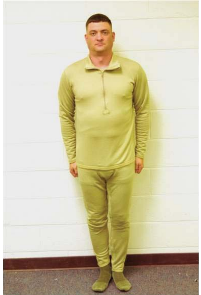
(b) Level 2: Mid-weight Cold Weather Shirt and Drawers. Use as a base layer next to skin or over Level 1 for added insulation and to aid in the transfer of moisture. Level 2 is designed to provide light insulation for use in mild climates, as well as, an additional layer for cold climates.