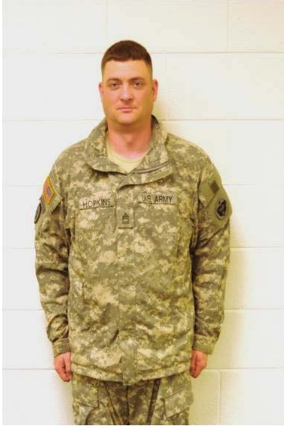
(e) Level 5: Soft Shell Cold Weather Jacket and Trousers. Wear as the outer shell layer when the average temperature is above 10° F. This is an authorized garrison outer garment.