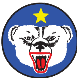
Figure 1. United States Army Alaska Crest

A circular disk of a blue background upon which is superimposed a polar bear's head surmounted with a gold star. It represents the Army as guardian of the far north depicted by the polar bear, which, according to myth, is guardian of the North Star, represented by a yellow star. Figure 1 below shows the insignia.