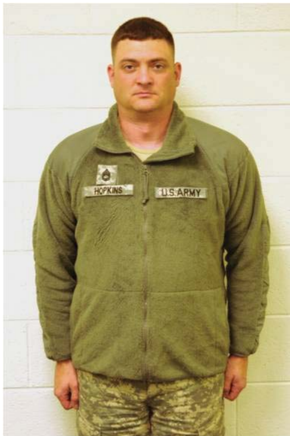
(c) Level 3: Fleece Jacket. The primary insulation layer for use in moderate to cold climates. The green fleece jacket is authorized to be worn as an outer garment during moderate dry cold weather in the field when designated as the uniform of the day down to Company level. This item will not be worn as an outer garment in garrison.