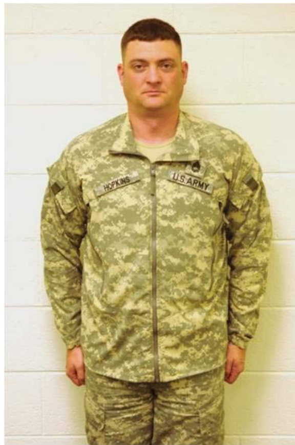
(d) Level 4: Wind Cold Weather Jacket. A lightweight outer shell layer made of a windproof and water repellant material. This layer will not be worn as an outer layer of the Winter Garrison Uniform.