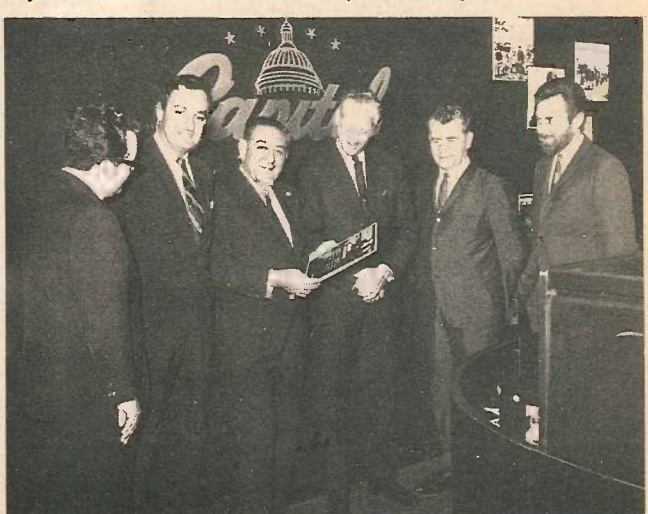
When Guy Lombardo played Toronto he took time off to visit Capitol's new headquarters and meet with top execs.