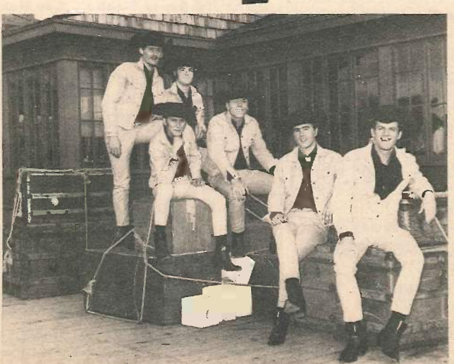
The Stampeders are moving up the charts rapidly with their first release for MWC "Morning Magic".