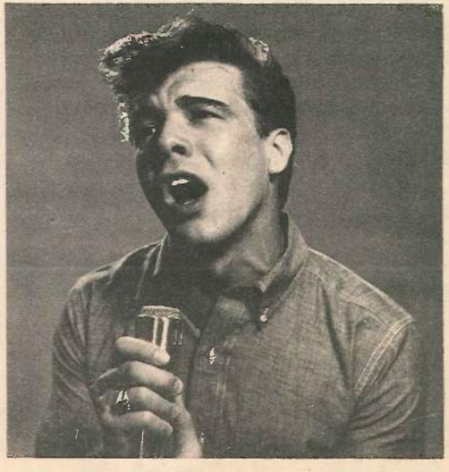
The Bobby Brittan Group featuring Bobby Brittan created a stir recently in the Village