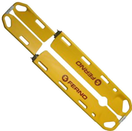
Fig. 1 Scoop stretcher.