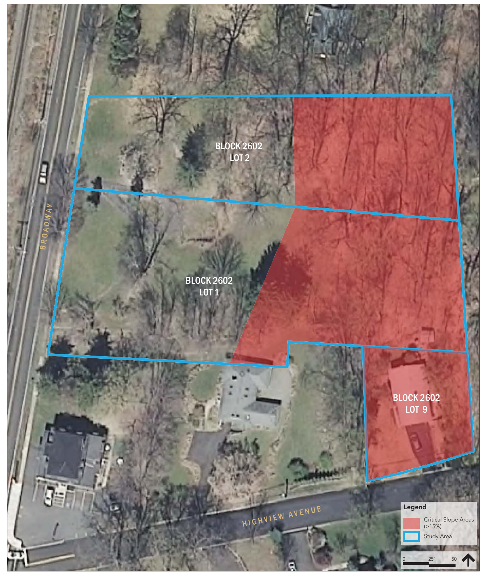
Figure 8: Critical Slope Areas | BLOCK 2602, LOTS 1, 2 AND 9, BLOCK 2501, LOT 14 | BOROUGH OF WOODCLIFF LAKE, NJ