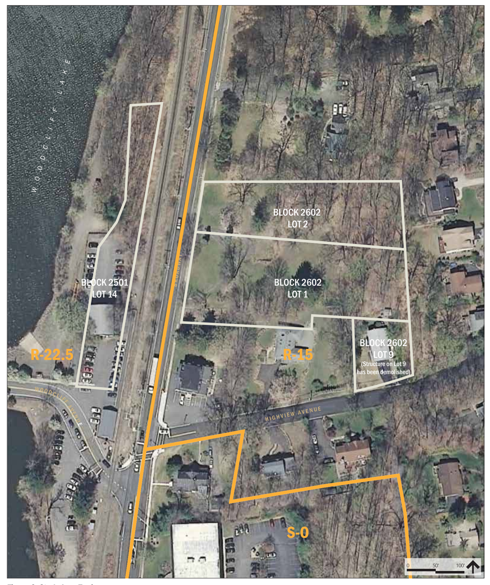
Figure 6: Study Area Zoning | BLOCK 2602, LOTS 1, 2 AND 9, BLOCK 2501, LOT 14 | BOROUGH OF WOODCLIFF LAKE, NJ