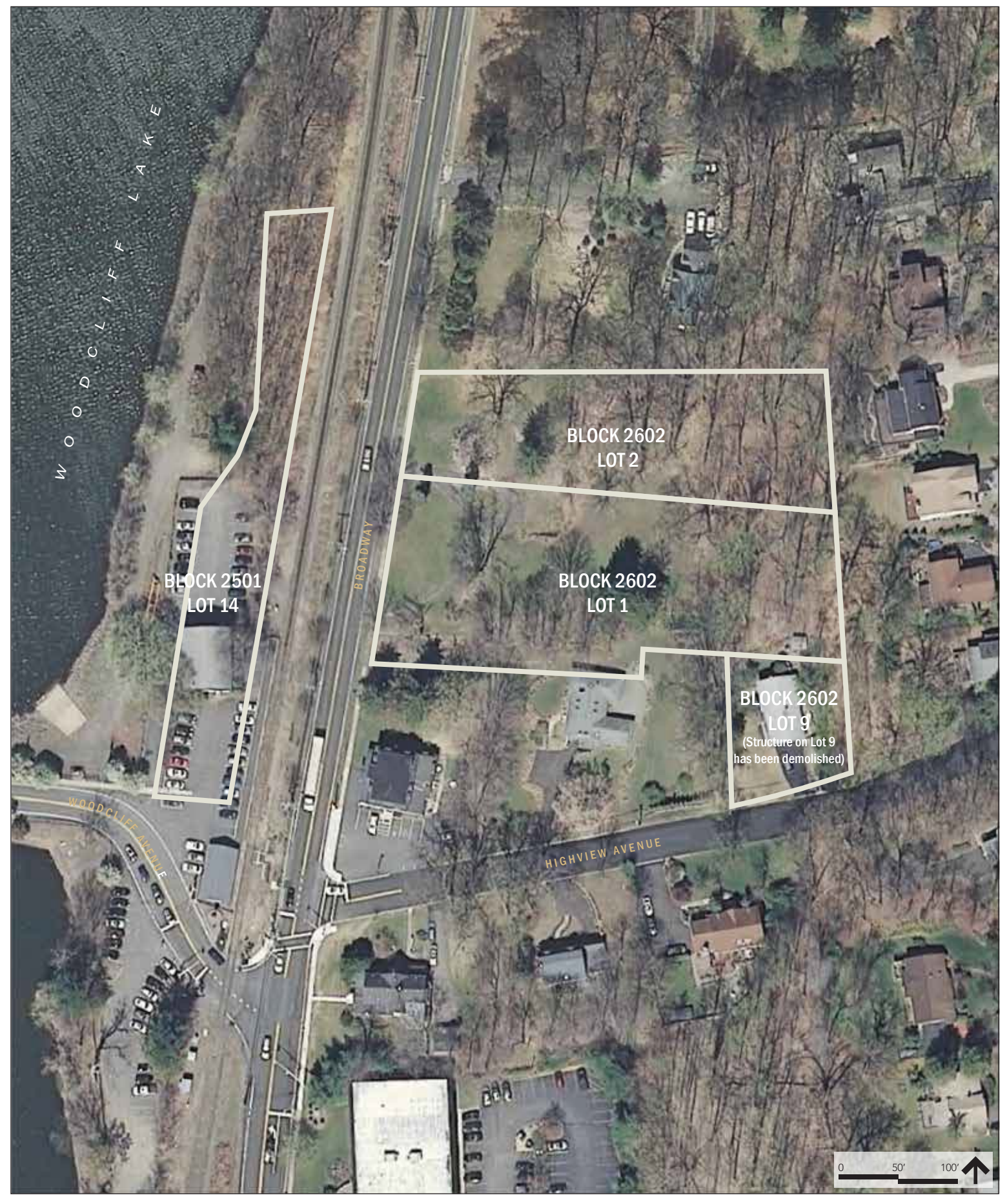
Figure 3: Study Area Context - Aerial | BLOCK 2602, LOTS 1, 2 AND 9, BLOCK 2501, LOT 14 | BOROUGH OF WOODCLIFF LAKE, NJ