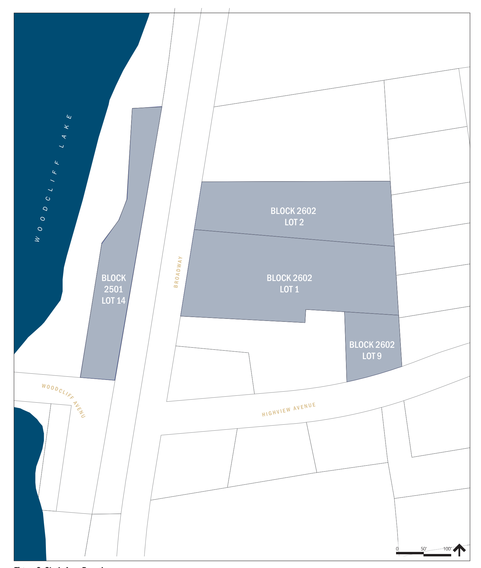
Figure 2: Study Area Parcels | BLOCK 2602, LOTS 1, 2 AND 9, BLOCK 2501, LOT 14 | BOROUGH OF WOODCLIFF LAKE, NJ