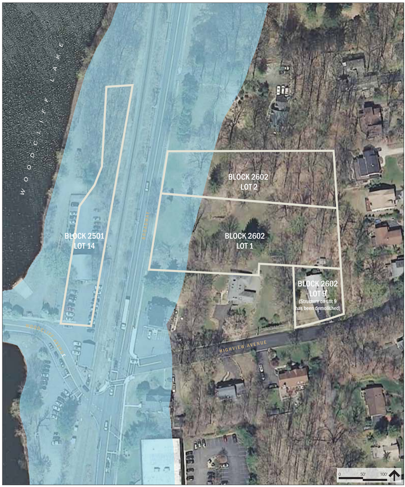
Figure 7: 300-Foot Category 1 Special Water Resource Protection Area Buffer within the Study Area BLOCK 2602, LOTS 1, 2 AND 9, BLOCK 2501, LOT 14 | BOROUGH OF WOODCLIFF LAKE, NJ