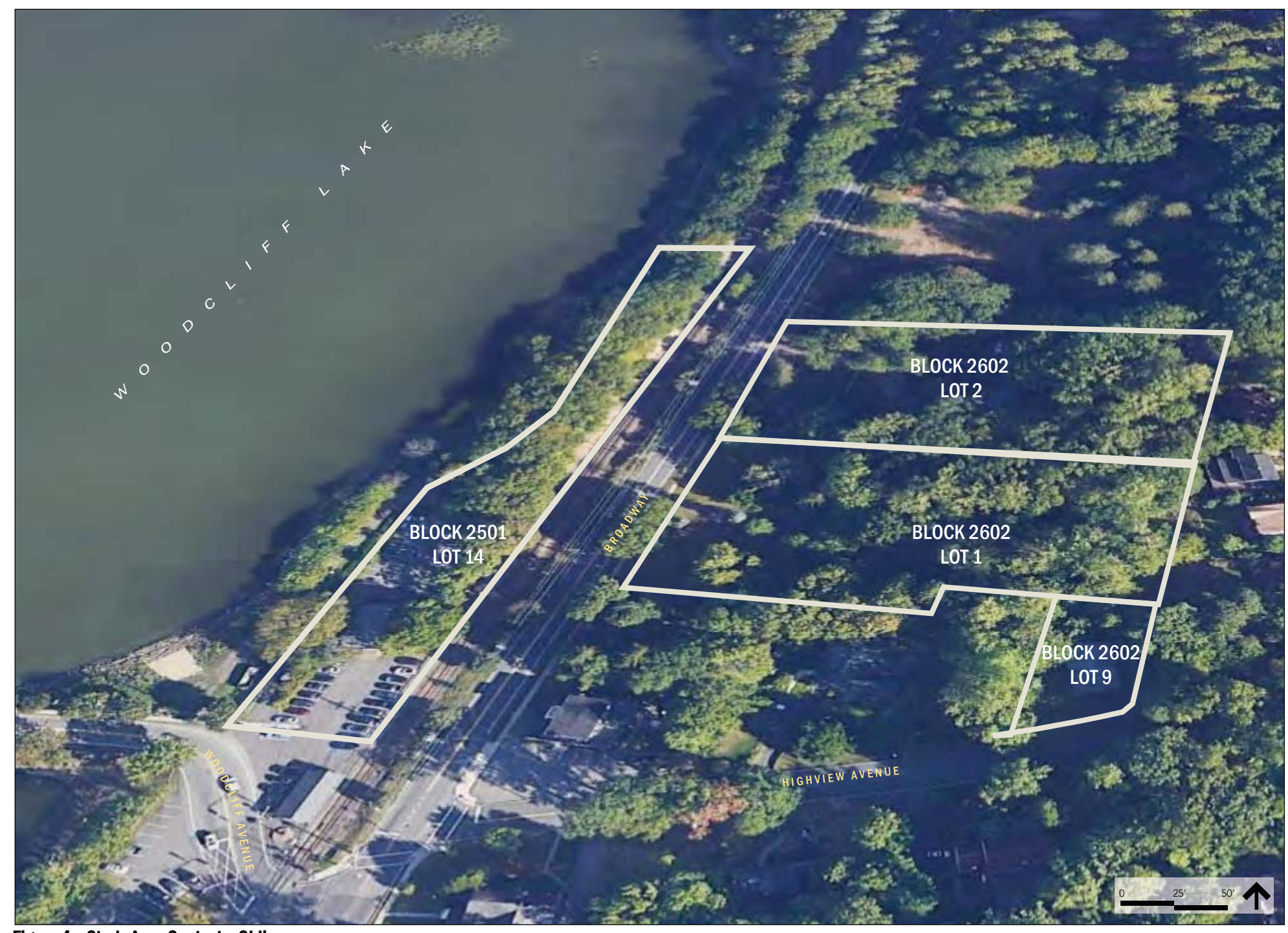
Figure 4 - Study Area Context - Oblique | BLOCK 2602, LOTS 1, 2 AND 9, BLOCK 2501, LOT 14 | BOROUGH OF WOODCLIFF LAKE, NJ