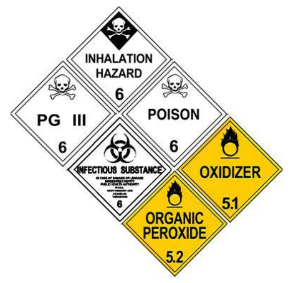
Figure 9.2 - Examples of HAZMAT Labels

Shippers put diamond-shaped hazard warning labels on most hazardous materials packages. These labels inform others of the hazard. If the diamond label won't fit on the package. shippers may put the label on a tag securely attached to the package. For example, compressed gas cylinders that will not hold a label will have tags or decals. Labels look like the examples in Figure 9.2.