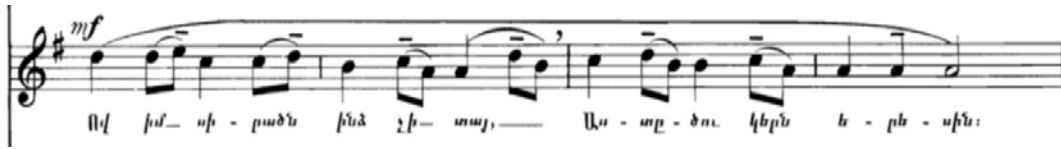
Example 8 a). Komitas: Armenian folk song "Habrban". 156