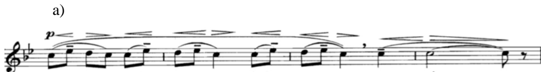
Example 1. a) Folk tune “Garuna” [It is Spring] 143

The cyclic introduction theme of the Trio is the core of the piece. Based on an Armenian folk song, “Garuna” [It’s Spring], it provides the basic thematic material for virtually all subsequent melodies in the Trio. The theme’s statements are also of structural importance in all three movements, appearing five different times, each usually in a different key. In the first movement, the introduction reappears at the beginning of the recapitulation and again at the very end of the movement, as part of the coda. In the ternary second movement, it occurs briefly before the return of the initial material (A’ section). In the third movement, it appears in the truncated recapitulation instead of the second and closing themes, followed by a brief coda. However, the only times it appears in F# minor, the original key of the trio, is the end of the first movement and in the third movement before the coda. Example 1 provides the folk tune itself and Babajanian’s rendition in the first four measures of the first movement.