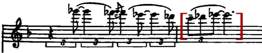
Example 3. a) Babajanian A. Piano trio: Movement 1, mm. 63-64. 146