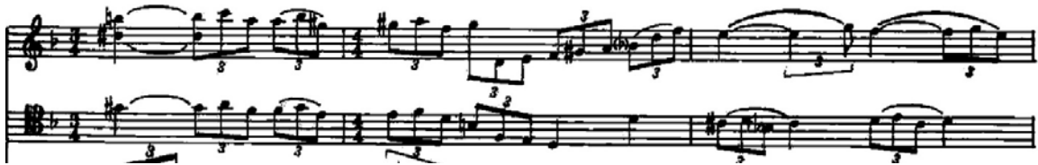
Example 8 d). Babajanian A. Piano Trio: Movement 1, mm. 76-78. 159

Babajanian's use of frequent accents in the piano part, an extended crescendo resulting in fortissimo in m. 46 and stretto in m. 49 to create a strong motion to the arrival and culmination of the movement.