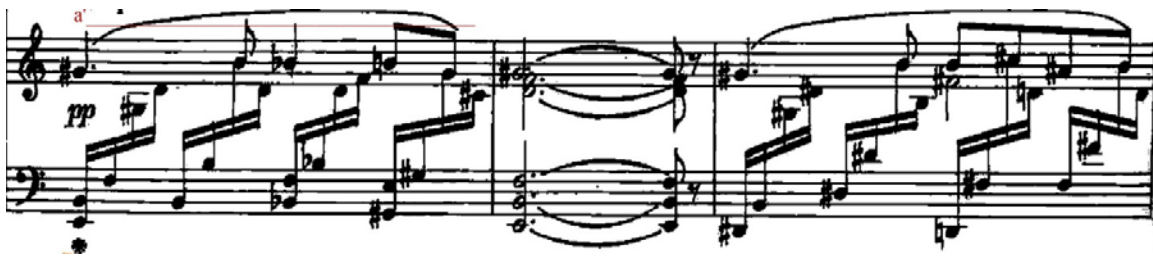
Example 5. Babajanian, A. Piano trio: Movement 1, mm. 83-85. 149

The first half of this first section, mm. 83-92, is repeated sequentially in mm. 93-109. In both segments, the “a” motive appears first in the piano part with answering flourishes in the violin and cello parts in octaves or sixths. The first half starts in E Major while its sequenced repetition begins in F Major. The “a” motive appears here beginning on the third scale degree, G# in the first instance, and A in the second, which differs from the tonic pitch opening of the primary theme. The first appearance is punctuated further by the use of the omnibus (mm. 84-86), which ends on a C# dominant ninth chord (m. 86). A small-scale varied repetition in mm. 87-92, with the theme now in the strings, begins in A Major (theme beginning on C#) but returns to the C#9 chord (m. 88). A second small variation in C Major (theme on E) initiates four bars emphasizing either C Major or its Neapolitan Db (C#). The final C seventh chord acts as an altered dominant leading to the following statement of the “a” motive in F Major. In retrospect, the emphasis on the C#9 chord in mm. 86 and 88, followed by the C7 in mm. 89 and 91, creates an elongated augmented-sixth chord to the dominant motion in preparation for the key of F Major that begins the second half.