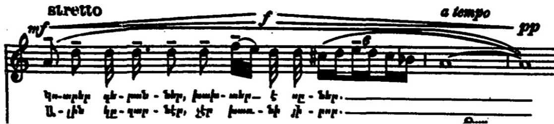
Example 7. Komitas: Armenian folk song "Antuni". 154

The second half includes emphasis on D and E#, as though it were in F# minor; however, just as the omnibus ends in m. 45, Babajanian returns to the C-D# pairing but then immediately negates it in the swift climb in both string instruments to the climactic portion anticipating the introduction theme in the next measure.