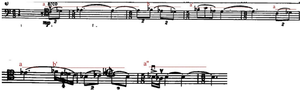
Example 9. b) Babajanian, A. Piano Trio: Movement 3, mm.71-78 163

In the secondary theme, Babajanian follows the pattern of tonality from the first movement. Like the first movement's secondary theme, here Babajanian uses only major keys (Ab, E, B).