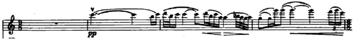
Example 6. a) Komitas: Armenian folk song "Antuni". 152