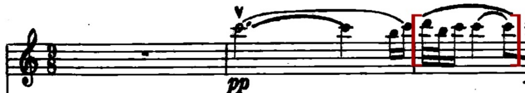
Example 3. b) Babajanian A. Piano trio: Movement 2, mm. 1-3. 147