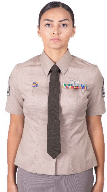
*With insignia and accoutrements