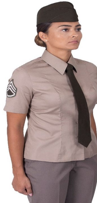
*Without insignia and accoutrements