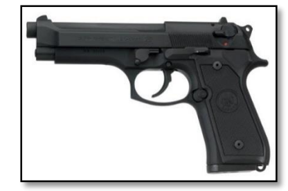
The Army M9 handgun

helicopter. And after spending $8 billion of taxpayer money on new helicopters, it will now instead refurbish its existing fleet. In each of these failures the Army was trying to acquire technology that simply did not exist and it was the development of those new technologies that led to major problems.