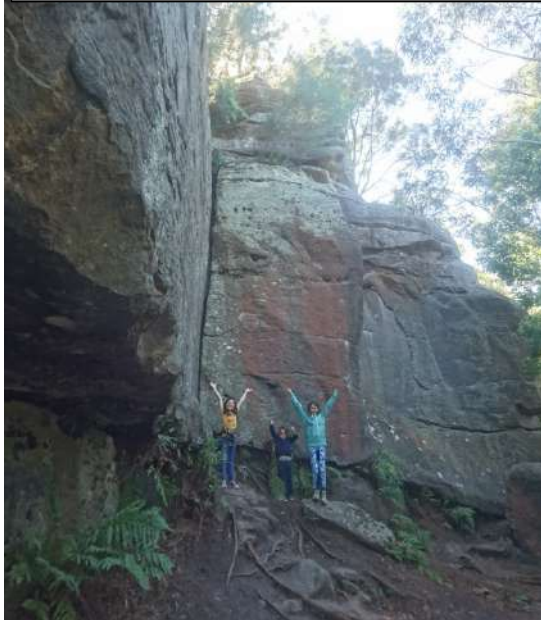
Poppy, Piper & Quentin went on a Bat Walk

Thank you to the students who sent in pictures of their activities on our “Arncliffe Unplugged” day last Tuesday. We hope you were able to enjoy a day away from screens.