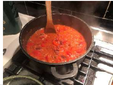
Eashan and Leo cooked choc mint slices, chilli con carne and banana bread bites. Yum!