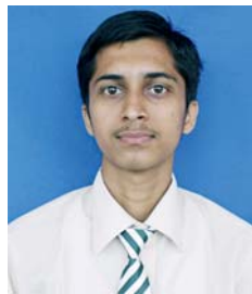
Ambed Kr Yadav Indian Embassy