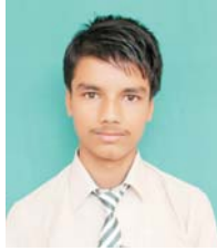
Om Sharma Optometry, Bir Hospital