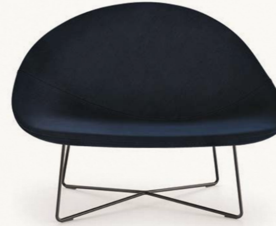
B. 3 Isola (cat. Armchair)

Cage Minimalism and pure elegance characterize the Cage tables, whose precious top comes in different types of marble, round or square.