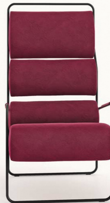
B.3 Sancarlo (cat. Armchair)