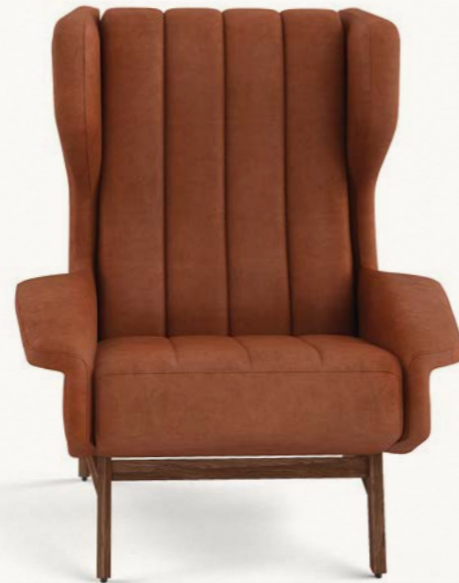
B. 2 Giulia (cat. Armchair)