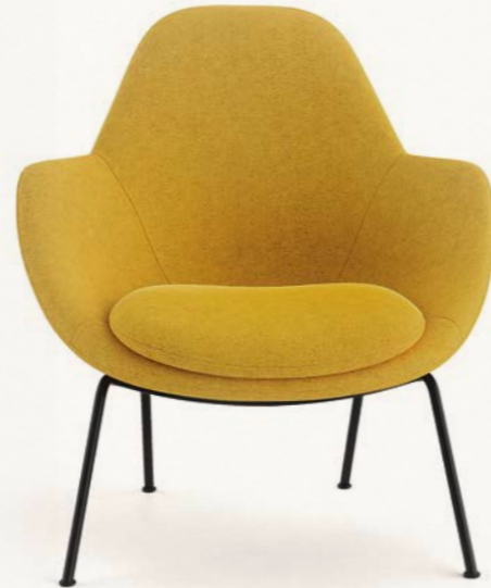
B.2 Dot (cat. Armchair)