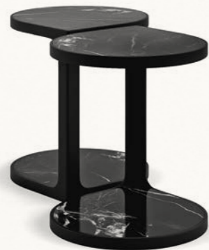
C. 1 Coot (cat. Low Table)

Cod. 1SPLI53 Ø 53 H 50 cm Cod. 1SPLI45 W 45 D 45 H 50 cm