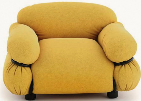
B.1 Sesann (cat. Armchair)