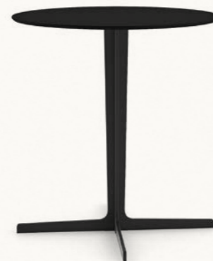
C. 2 Split (cat. Low Table)