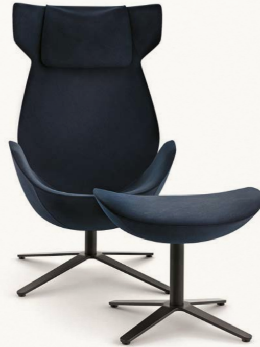
B. 2 Shelter (cat. Armchair)