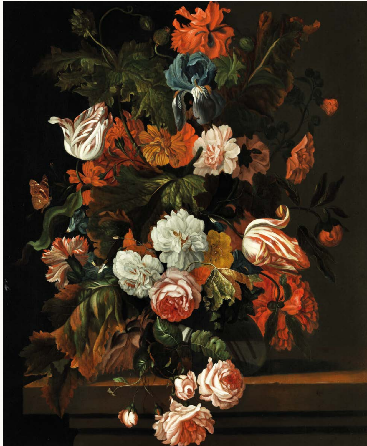
Ernst Stuken, flower still life, before 1712