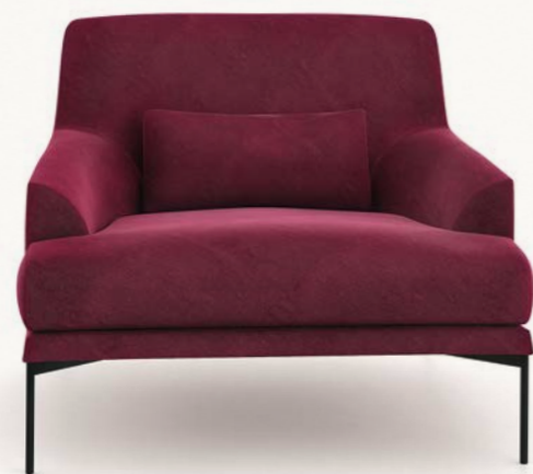
B.1 Montevideo (cat. Armchair)