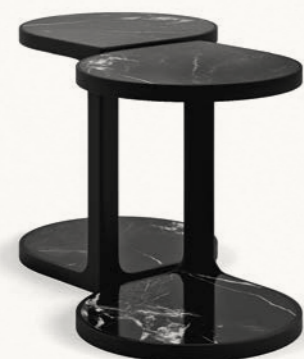
C.1 Coot (cat. Low Table)

Cod. 1SOAP54 W 54 D 54 H 54 cm Cod. 1SOAP130 W 130 D 62 H 35 cm