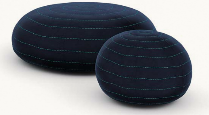
C. 1 Spin (cat. Ottoman)