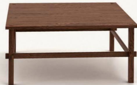
C. 2, D. 2 Gio (cat. Low Table)

Cage Minimalism and pure elegance characterize the Cage tables, whose precious top comes in different types of marble, round or square.