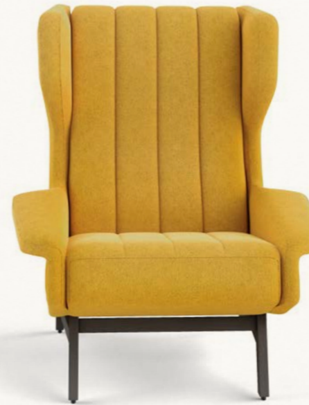
B.3 Giulia (cat. Armchair)