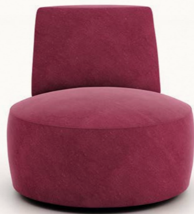
B.2 Baobab (cat. Armchair)