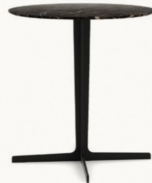
C. 3 Split (cat. Low Table)

Agnese Agnese is the relaunch of an historic project of Gianfranco Frattini, protagonist of Italian design and architecture in the XX century. Agnese armchair was in fact pointed out at Compasso d'Oro in 1956. Realized with philological fidelity and attention for every detail, from the ash wood structure with different finishes, to the harmonic set of body, backrest and arms, made with sartorial stitches, Agnese can be combined with a coordinated ottoman, like the original project of Gianfranco Frattini.