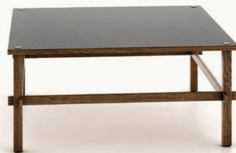
C.2 Cage (cat. Low Table)

Agnese Agnese is the relaunch of an historic project of Gianfranco Frattini, protagonist of Italian design and architecture in the XX century. Agnese armchair was in fact pointed out at Compasso d'Oro in 1956. Realized with philological fidelity and attention for every detail, from the ash wood structure with different finishes, to the harmonic set of body, backrest and arms, made with sartorial stitches, Agnese can be combined with a coordinated ottoman, like the original project of Gianfranco Frattini.