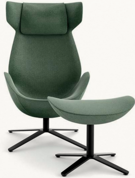
B. 1 Shelter (cat. Armchair)