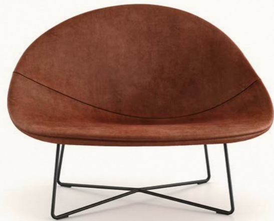
B. 1 Isola (cat. Armchair)