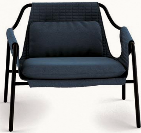
B. 1 Jacket (cat. Armchair)