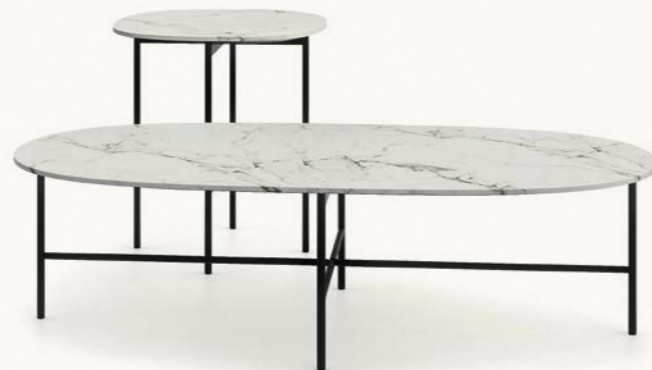
C.2 Soap (cat. Low Table)