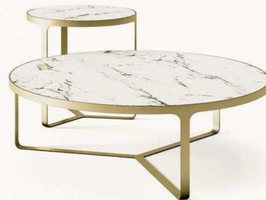
C. 2 Cage (cat. Low Table)