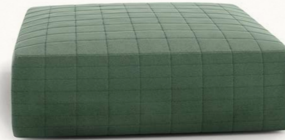
C. 1 Quartier (cat. Ottoman)