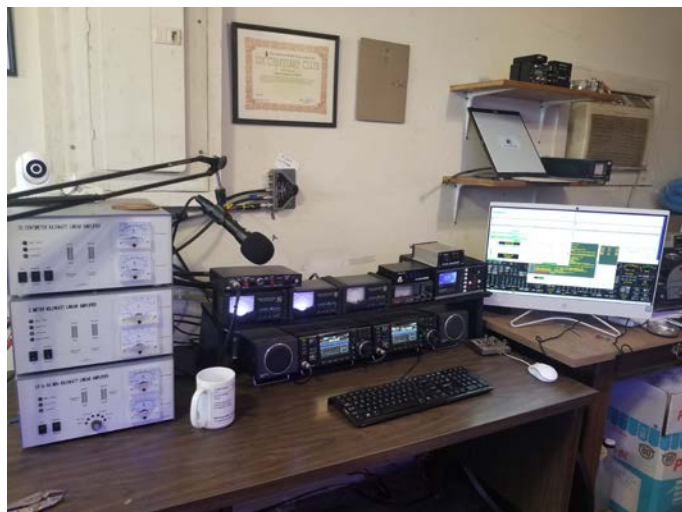
Here is the very neat and compact station at N5ITO. Great job Dave!