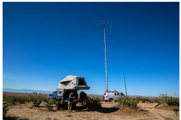
N6MI and K6VCR in Grid DM15aa during the June 2020 VHF Contest