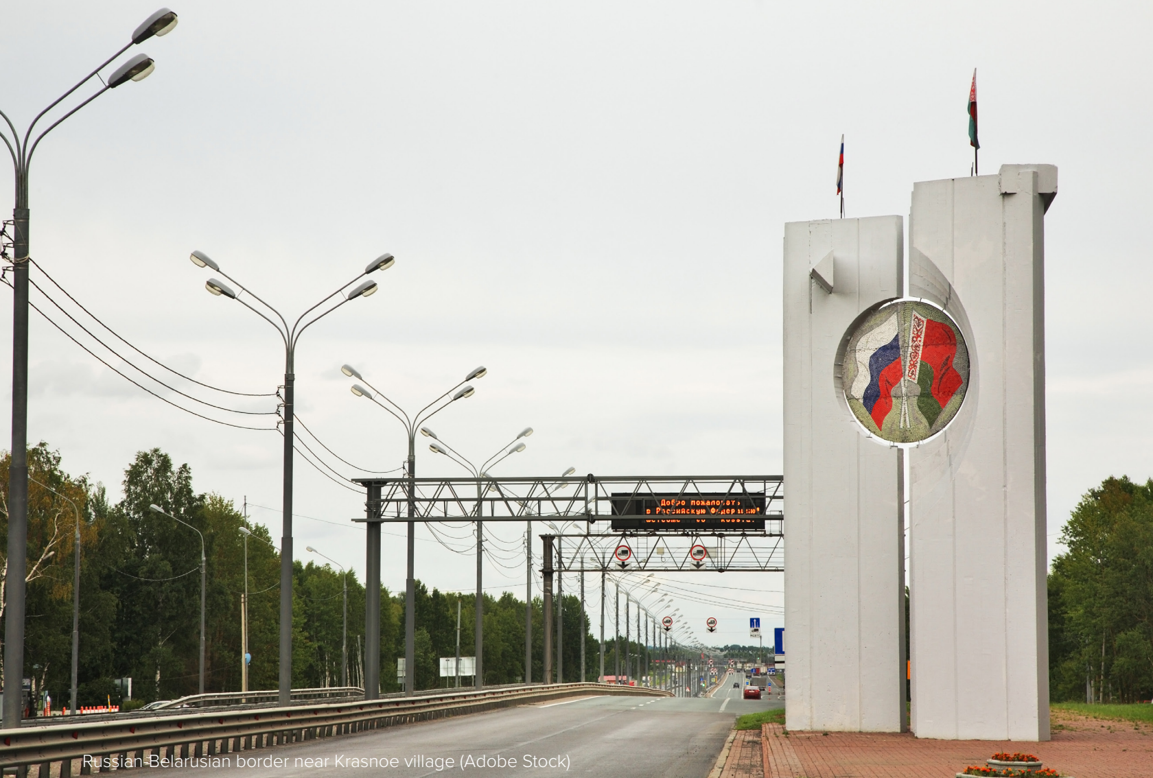
Russian-Belarusian border near Krasnoe village