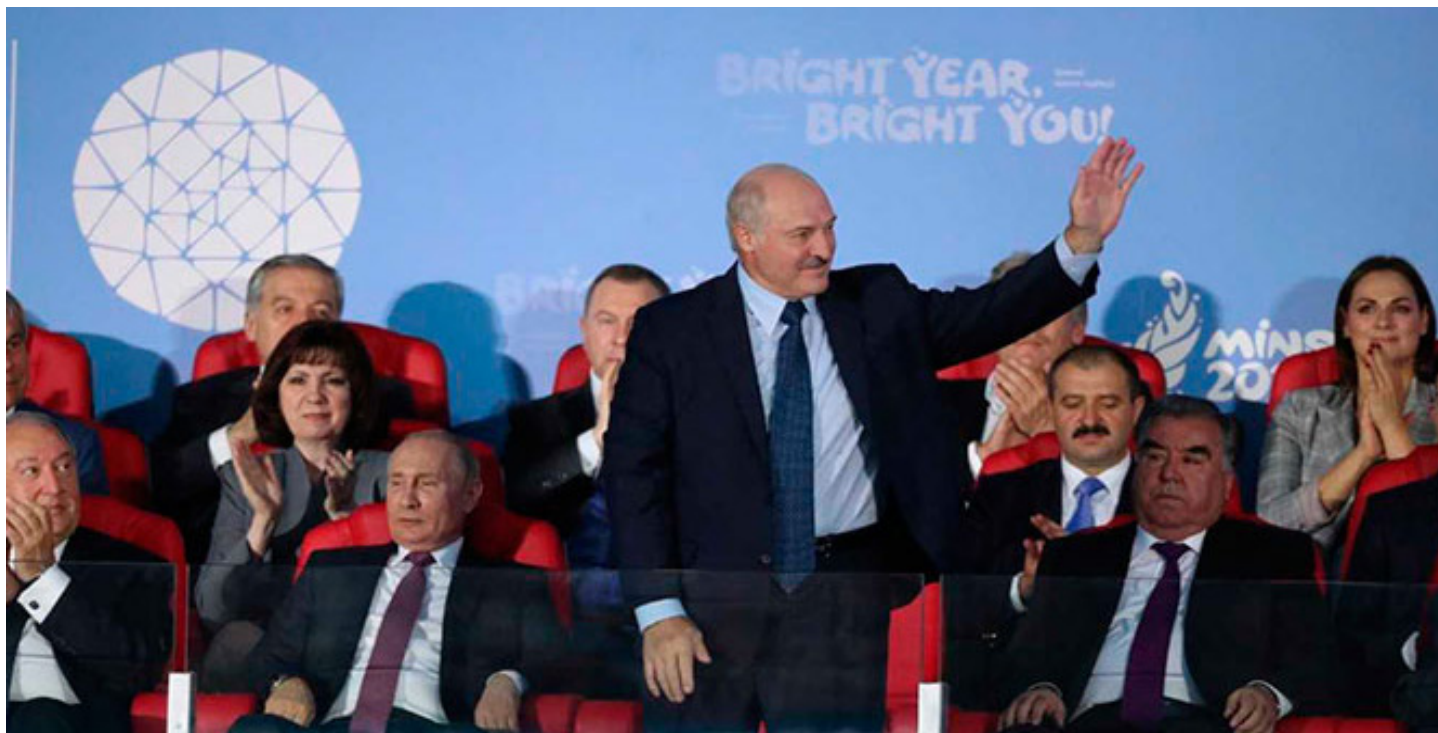
Closing ceremony of the 2nd European Games, JUNE 2019.

already been tasked with developing contingency plans for Belarus, justifying Russia's potential "preventive interference" in the country's domestic affairs. The options developed by several Russian think tanks close to the Kremlin range from deeper integration under Russian coercion, to the deployment of Russian military bases, to regime change and even a Crimea-like intervention in Belarus after 2024. 50 These scenarios might be triggered if Kremlin strategists believe Russia is irreversibly losing Belarus. But these suggestions also show dramatic shifts in Russia's strategic thinking toward Belarus, a hostage of Moscow's zero-sum game geopolitical thinking.