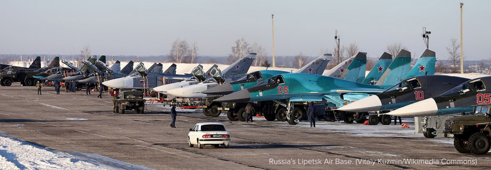
Russia's Lipetsk Air Base.

In September 2015, the Kremlin unilaterally announced it would deploy a Russian military airbase in Belarus without Minsk's prior consent. 12 Belarus' leadership refused to accommodate the Kremlin, recognizing that a Russian military base would undermine the security guarantees Lukashenko gave neighboring countries at the start of the Russia-Ukraine conflict. According to these security assurances, Belarus will not provide its territory to Russia to commit aggression against Ukraine and other neighbors. Belarus also learned from the Ukraine conflict, seeing how the Kremlin used the pre-existing military bases of Black Sea Fleet in Crimea to undermine Ukraine's sovereignty and territorial integrity. Nevertheless, Moscow's plans demonstrate a desire to avoid losing geopolitical influence. Belarus and Russia are formally strategic military allies, united by a