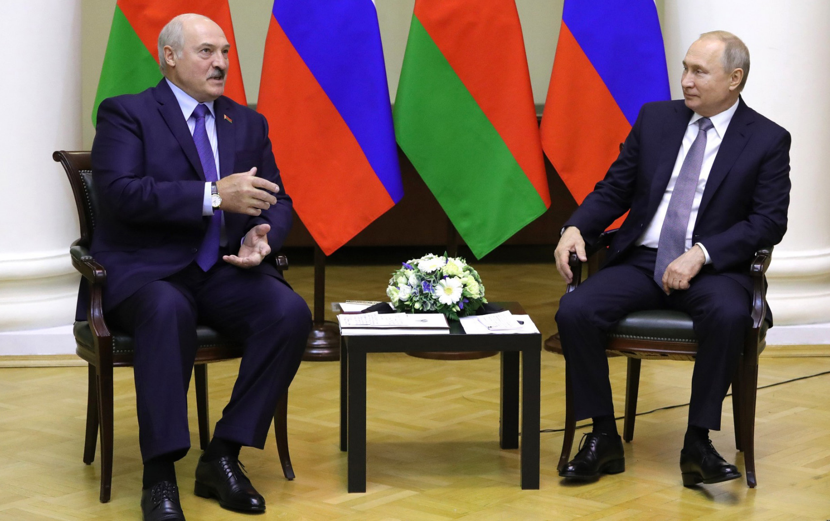
Meeting of Russian President Vladimir Putin and Belarusian President Alexander Lukashenko before the plenary session of the 6th Forum of Russian and Belarusian Regions in July 2019.

sovereignty, an escalation of tension is inevitable.