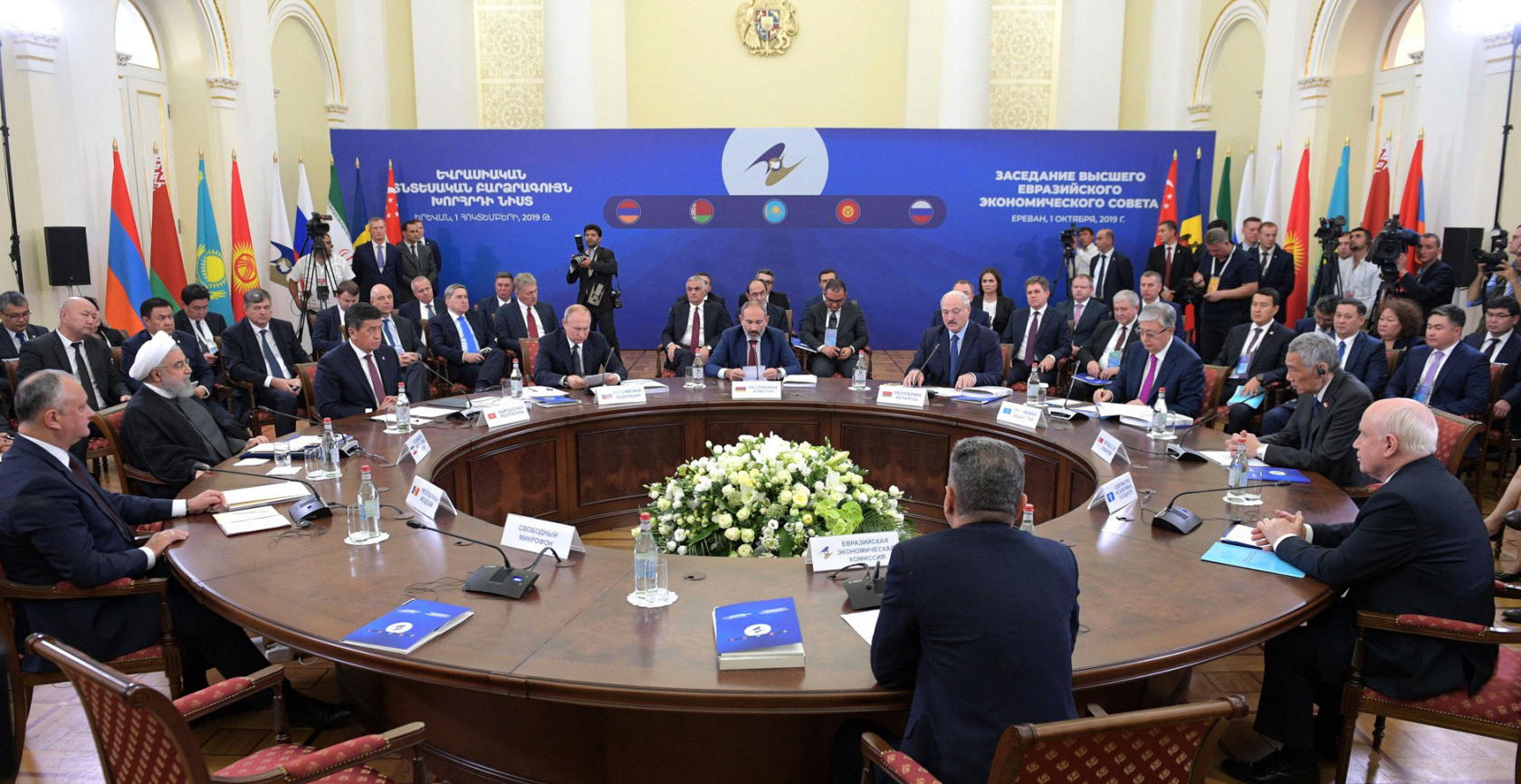
Meeting of the Supreme Eurasian Economic Council in Yerevan, October 2019.

Russian Prime Minister Dmitry Medvedev stated that Russia was ready for further integration with Belarus within the framework of the Union State Treaty. 27