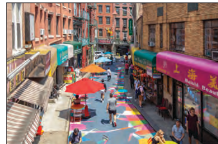
Asphalt Pedestrian Space Dan Monteavaro (Moncho1929)