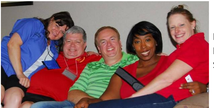
Fun in the Hospitality Suite!