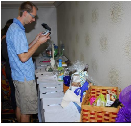
A JC checking out the Silent Auction before bidding