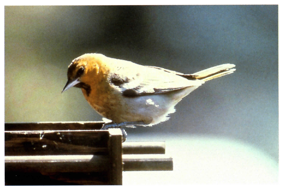
Figure 6: First alternate male Bullock's Oriole at Willowdale, Toronto , from 1 to 18 April 1980.