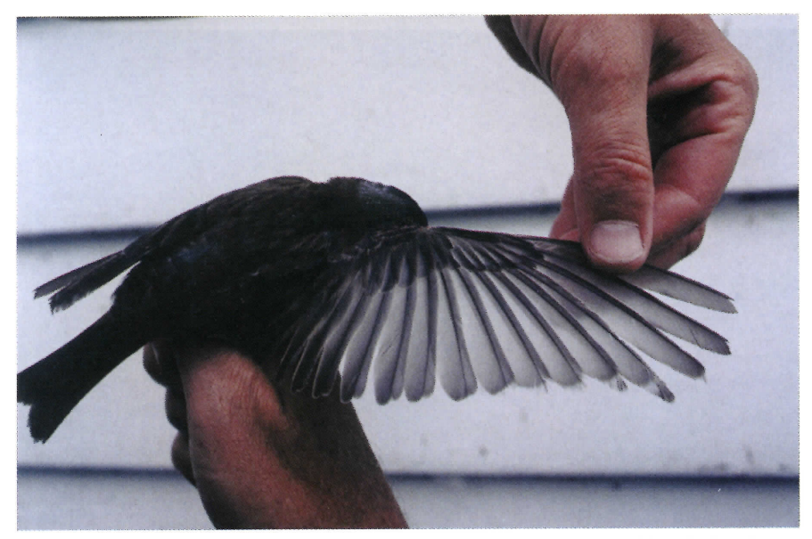
Figure 7: First basic male Gray-crowned Rosy-Finch, captured and banded, at Long Point Tip, Haldimand-Norfolk , from 8 to 10 July 1999.