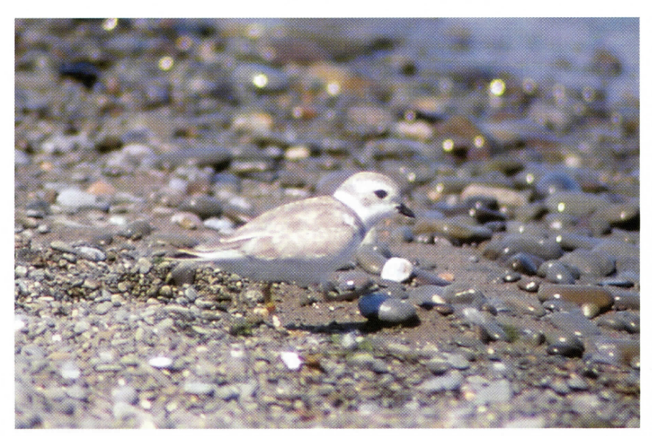
Figure 2: Juvenal Piping Plover at Van Wagners Beach, Hamilton-Wentworth , from 12 to 16 September 1999.