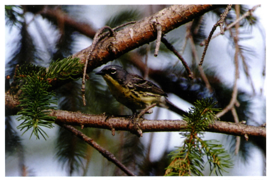
Figure 5: First alternate Kirtland's Warbler at Forest, Lambton , on 9-10 June 1999.