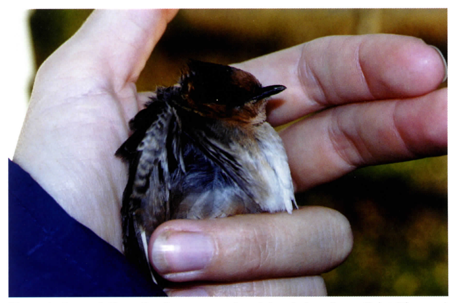
Figure 4: Juvenal Cave Swallow captured and banded at Long Point Tip on 4 November 1999.