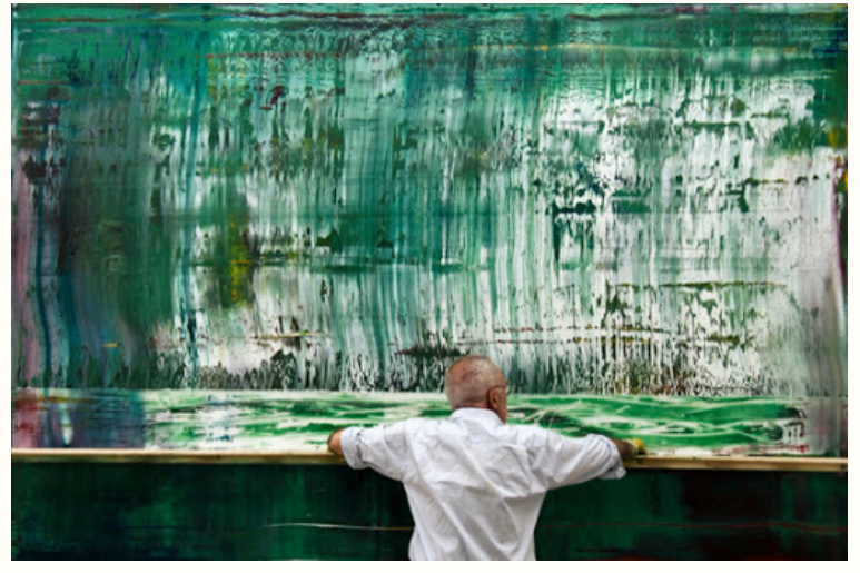
Richter at work, ca. 2011 Still from film, Gerhard Richter Painting

The Met Breuer's 2020 exhibition, Gerhard Richter: Painting After All explores the duality between representation and abstraction that underpins Richter's prolific six-decade career, emphasizing the value of painting as an artistic medium. Digital resources include an <u>exhibition guide</u> and a <u>virtual tour</u> of the galleries, as well as <u>interviews with artists</u> on Richter's continuing influence. Curator's also <u>contributed their insights</u>. "Ultimately, Richter's work is about pictorial and painterly traditions. Standing in front of a painting has more of a singular presence and relevance to our actual living moment than photography will ever have, because photography always marks the instant of passing—the death—of the very moment it records. It is this paradox, burrowed deep in Richter's work, that enables the image to continue to live, to be relevant."