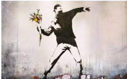
A famous Banksy's painting, Gaza

Banksy is one of the greatest street artists in the world, you can for example admire his work in London, NYC, Gaza... Although his work is globally famous, his name and face are a real secret. Native from Bristol (England), it is almost the only thing we know about him. Since his beginnings, years ago, his identity is still unknown, or at the least uncertain.