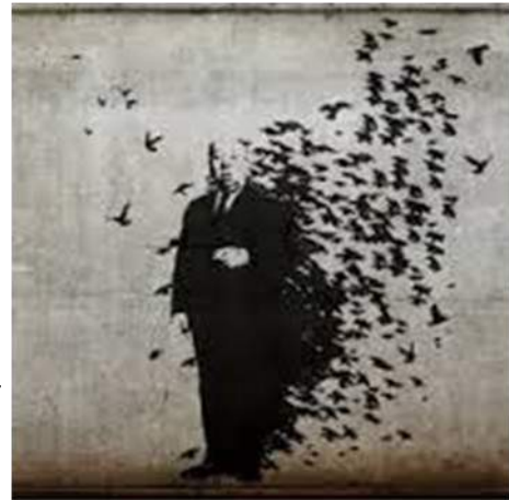
Hitchcock and the birds.