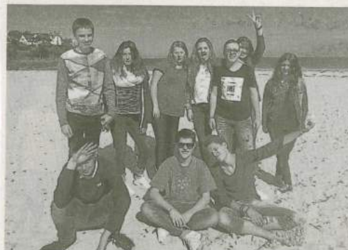
Entre deux films, une partie des élèves de Suscinio sur la plage de Dinard.

La semaine dernière, les élèves de seconde, première et terminale scientifique et technologique de la section européenne du lycée de Suscinio ont participé au Festival du film britannique de Dinard, qui s'est déroulé du 28 septembre au 2 octobre sous la présidence de Claude Lelouch.