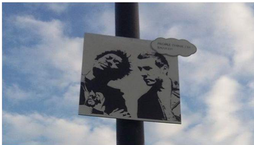
The day after, a Banksy-styled painting appeared near where the concert took place : People think I'm BANKSY

...Replied 3D in front of 27.000 spectators. « Banksy is a friend, and this hypothesis is based on coincidences. », so he buried the rumor.