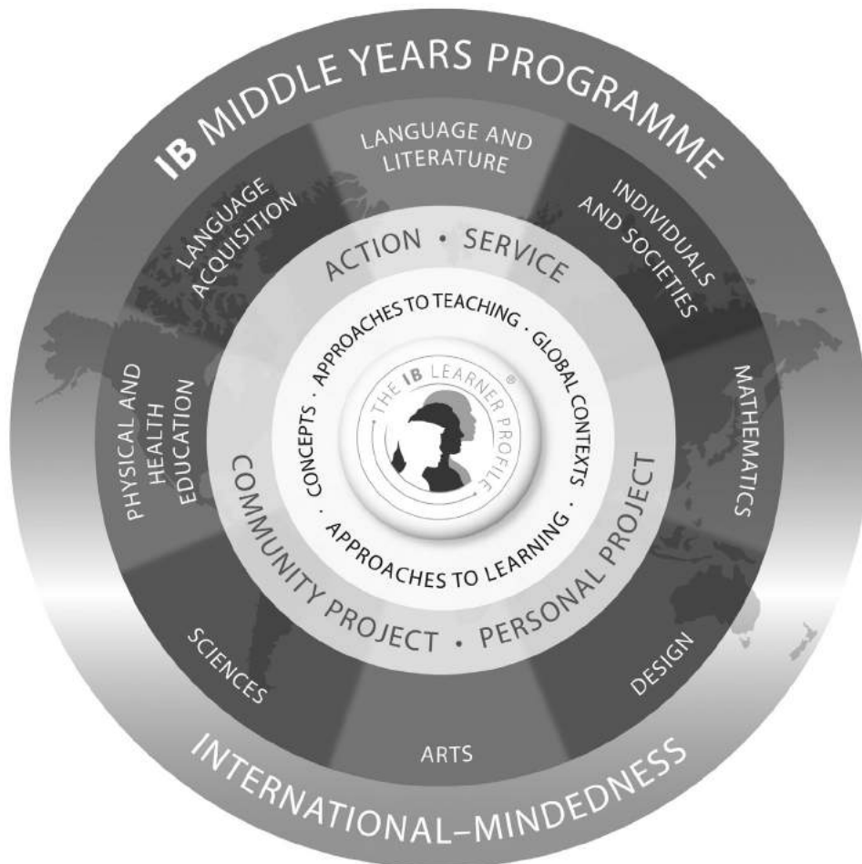
Figure 1 Middle Years Programme model

The MYP is designed for students aged 11 to 16. It provides a framework of learning that encourages students to become creative, critical and reflective thinkers. The MYP emphasizes intellectual challenge, encouraging students to make connections between their studies in traditional subjects and the real world. It fosters the development of skills for communication, intercultural understanding and global engagement—essential qualities for young people who are becoming global leaders.