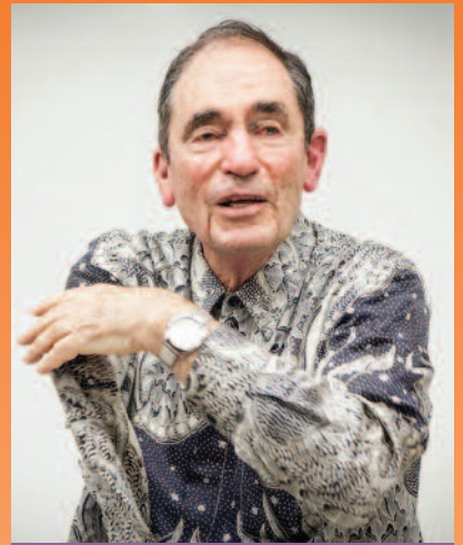
Albie Sachs Greeley Scholar for Peace Studies