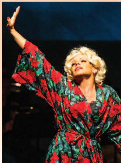
Greater Lowell Music Theatre

Non-Profit Org U.S. Postage PAID Lowell, MA Permit No. 69