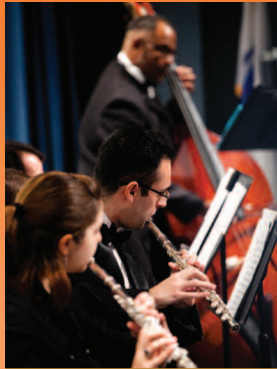
Student Concerts Music Dept.