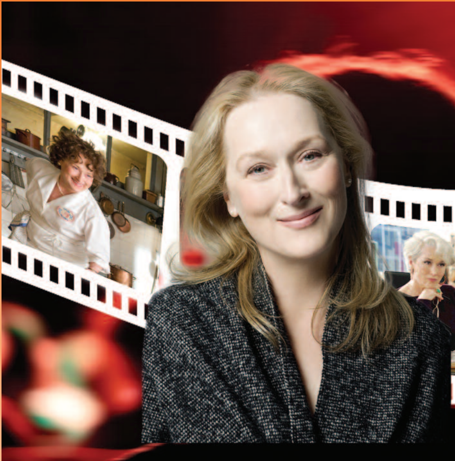
Meryl Streep Chancellor's Speaker Series

Spring 2014 Published by the UMass Lowell Center for Arts and Ideas