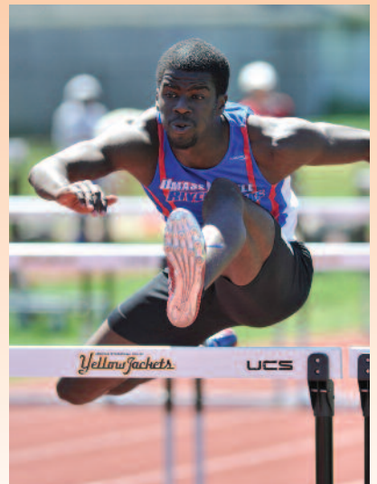
UMass Lowell Spring Sports