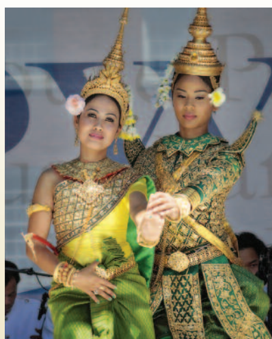
Celebrate Cambodian Arts