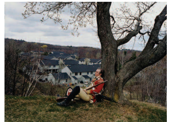
'British Redcoat' re-enactor, Battle of Concord and Lexington, Lexington, Mass., 2002. From the series "Perfectible Worlds."