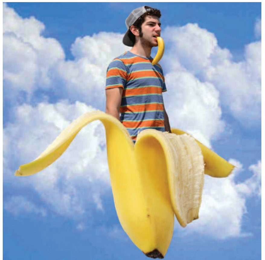
Spring 2013 Show: Form & Content, Drawing, Art Concepts I & II and Digital Foundations

Senior thesis projects from the Art and Design studios will be featured in the Dugan and University galleries.