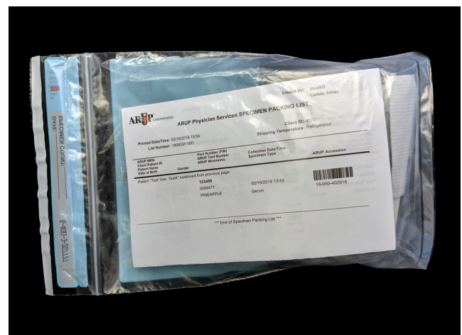
Packing list or test request forms fit into the outside sleeve.