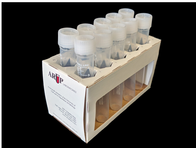
Each ARUP rack holds 10 tubes.

Couriers are prohibited from picking up specimens that are leaking or are not in secondary containers (i.e., ARUP color-coded specimen bags or pressurized specimen containers). Tube racks must be marked with the correct holding and transport temperature and placed in the corresponding temperature-specific, color-coded bags. Clients are responsible for packing specimens in the appropriate color-coded specimen bags. Tube racks meet the DOT requirement to keep fragile specimen containers from coming in contact with one another. Alternatively, fragile specimens must be individually wrapped in a specimen bag or with absorbent material.