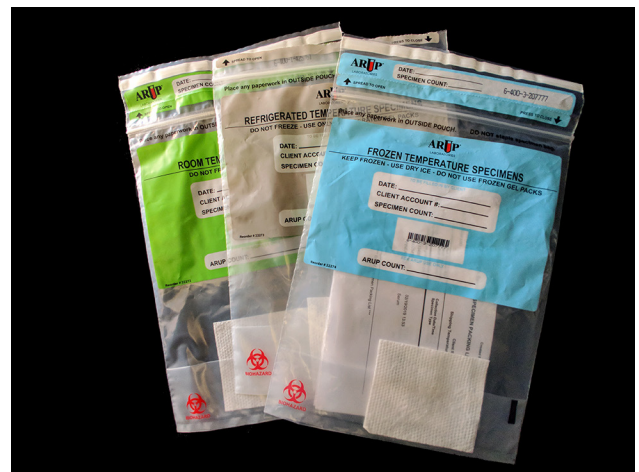
Green: Room temperature (ambient) specimens Gray: Refrigerated specimens Blue: Frozen specimens

i If submitting more than one specimen per patient, and if specimens need to be stored and transported at different temperatures, use separate bags and include the patient and specific test(s) on separate and temperature-specific packing lists (or manual requisitions).