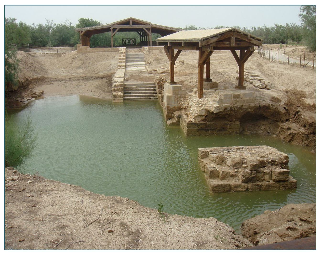
Al-Maghtas (baptism site) ruins on the Jordan River