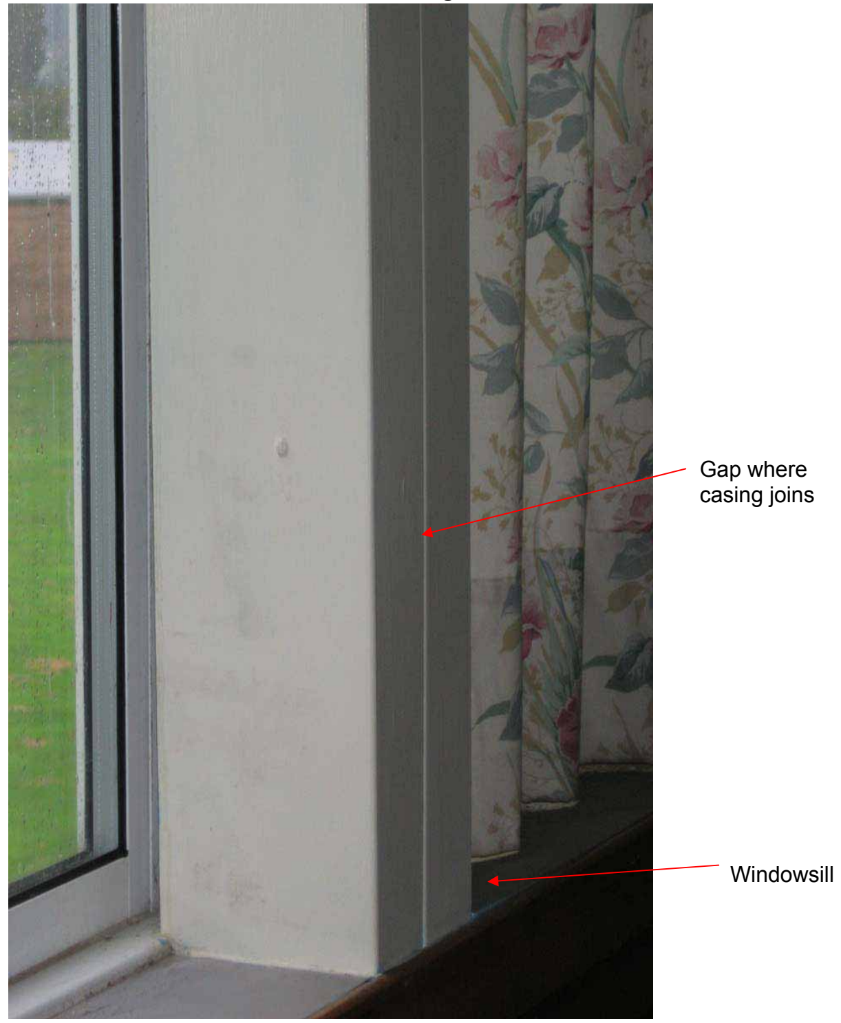
Figure 2: Metal clad column showing gap at front of column where the two halves of the cladding meet