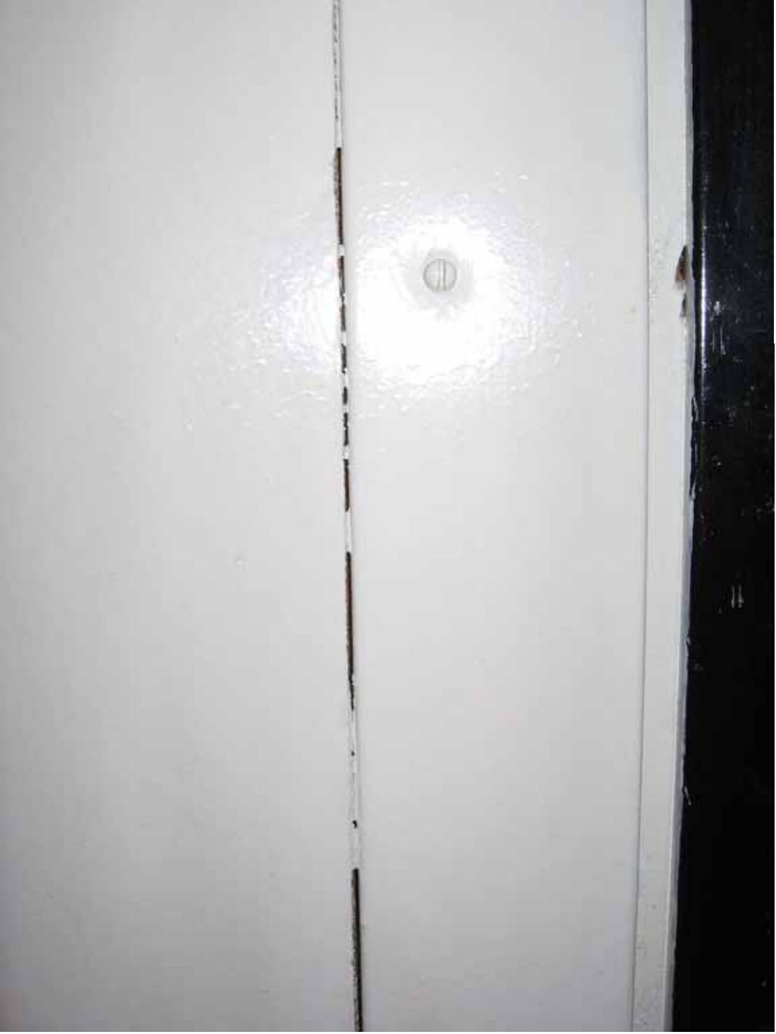
Figure 4: Example of a gap in the casing