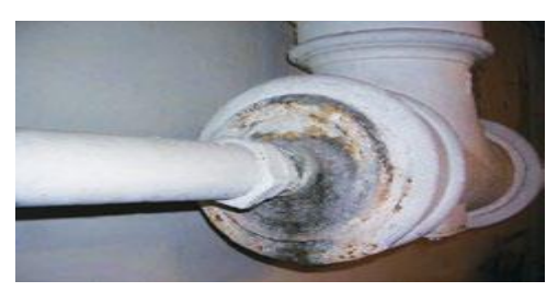
Amosite and chrysotile packing on a water pipe (friable)