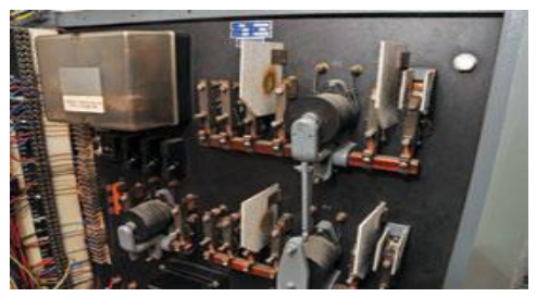
Electrical switchboard with asbestos flash guards. Switchboards can also contain an A-C sheet or resin/black backboard that contains asbestos. (non-friable)