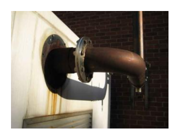
Asbestos gaskets in pipe flange joints (non-friable unless disturbed)

Spray coating in building walkway (friable)