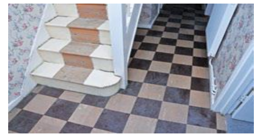
PVC or vinyl floor tiles and/or backing material with added asbestos (low %) chrysotile (non-friable). Tiles may also be laid on "black jack" adhesive containing chrysotile asbestos.