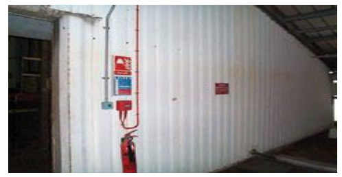
Asbestos bitumen coating under metal cladding (non-friable)