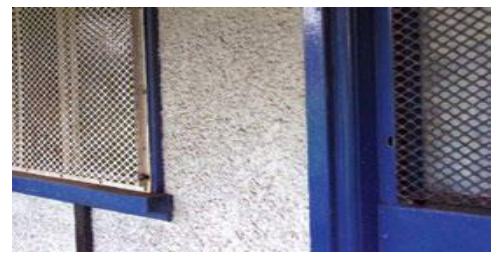
Chrysotile pebble dash exterior wall coating (non-friable)