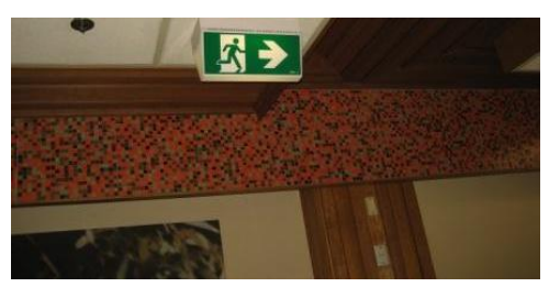
Ceramic tiles laid over a.c Sheet (chrysotile) backing (non-friable)