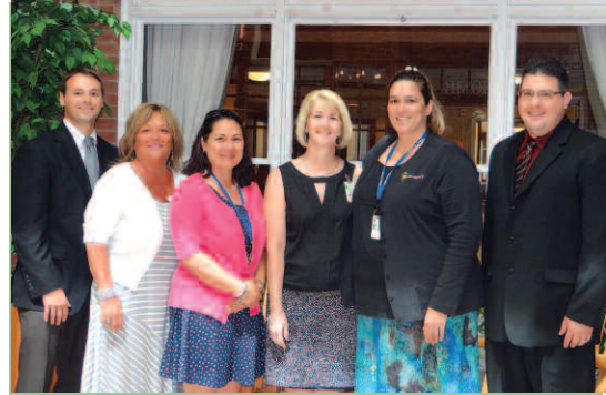
Proud Project SEARCH Graduates of 2016