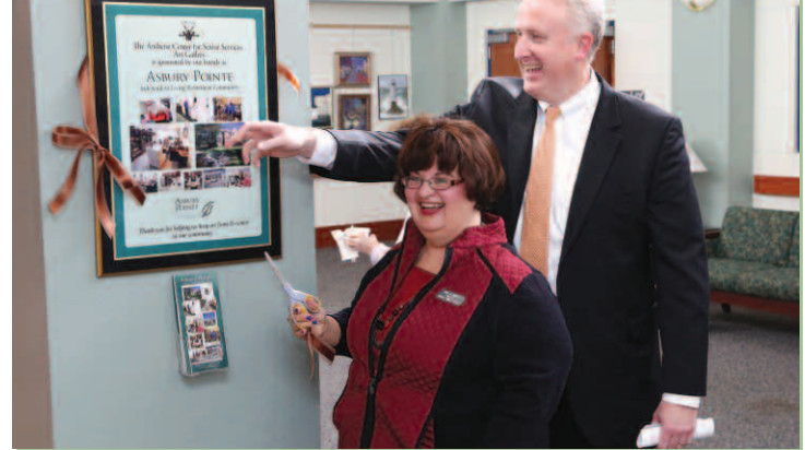
Williamsville Art Society's Spring Show