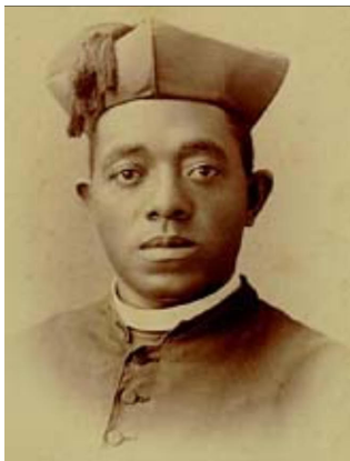
Fr. Augustus Tolton

Our Church is blessed with gifts of many cultures and traditions. February marks the celebration of Black History Month or National African American History Month, which is an annual celebrations achievements by the black Americans and a time for recognizing the central role of the African Americans in U.S. history. As a parish we will mark this time of celebration with Sunday vigil Mass February 25th. Please come along and celebrate with gospel music and our visiting celebrant. For more information on Fr. Tolton log on to http://www.toltoncanonization.org