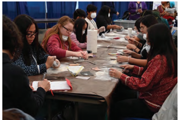
Photo from the 2019 Elders & Youth Conference