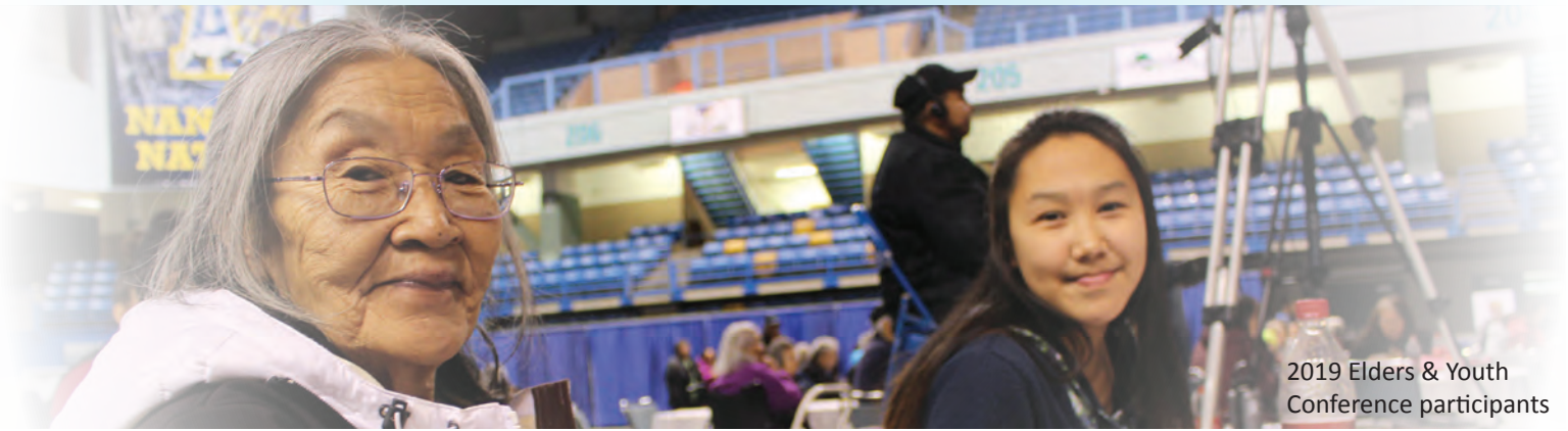
2019 Elders & Youth Conference participants

As Alaska Native peoples, we are the first and forever stewards of Alaska and our peoples are the conduits for this special relationship. Over 10,000+ years of ancestral knowledge is embedded and entrusted into the living generations to pass on to the future. Paramount to this is staying alive so to ensure the safety of our people we will host our 37th Annual Statewide Elders & Youth Conference virtually. Our theme, “Asirqamek Apruciluta” (Sugt’stun, Chugach), “Asisqamek Aprut’liluta” (Alutiiq) assures us that we are moving in the right direction – physically in our real world today and symbolically in life. Its translation into English is “We Are Making a Good Path.” Our ancestral responsibilities through Elders & Youth, our keynotes and conferences guides, will help us do this together.