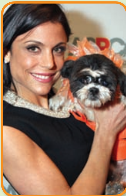
Bethenny Frankel of the TV show The Real Housewives of New York City and a furry friend.