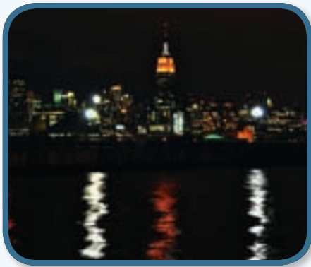
New York's Empire State Building goes orange.

a day when animals live free from pain and suffering.”