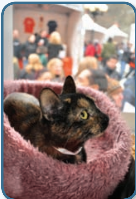
One of the many cats and dogs featured in the ASPCA Adopt-a-Van at Union Square Park.

As Presenting Sponsor, Subaru showed its support for our “Go Orange for Animals” campaign by raising awareness for the cause, including on-site participation at the ASPCA events in New York City, Austin and Venice Beach. In New York City, Subaru unveiled a brand-new custom-wrapped 2009 Subaru Forester that was donated to the ASPCA. Five other Subaru vehicles were also delivered to local animal welfare facilities across the United States. In addition, dealers across the country held local events and dressed up their showrooms with new ASPCA-themed point-of-sale advertising, including banners, posters and balloons in select markets. In Los Angeles, beginning April 25, Subaru also started to sponsor weekly Pets 2 Love segments on CBS 2 News , featuring