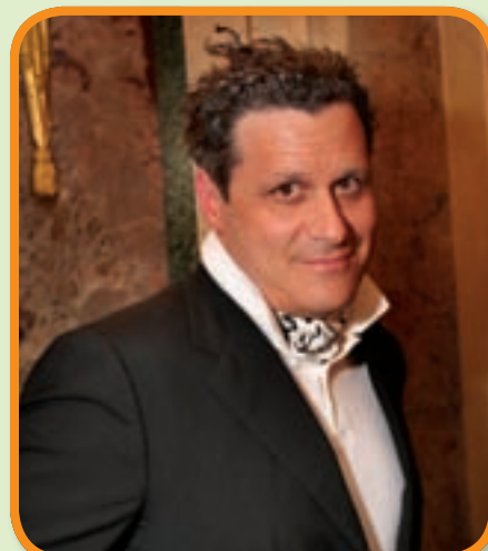
Isaac Mizrahi, emcee of the Bergh Ball.