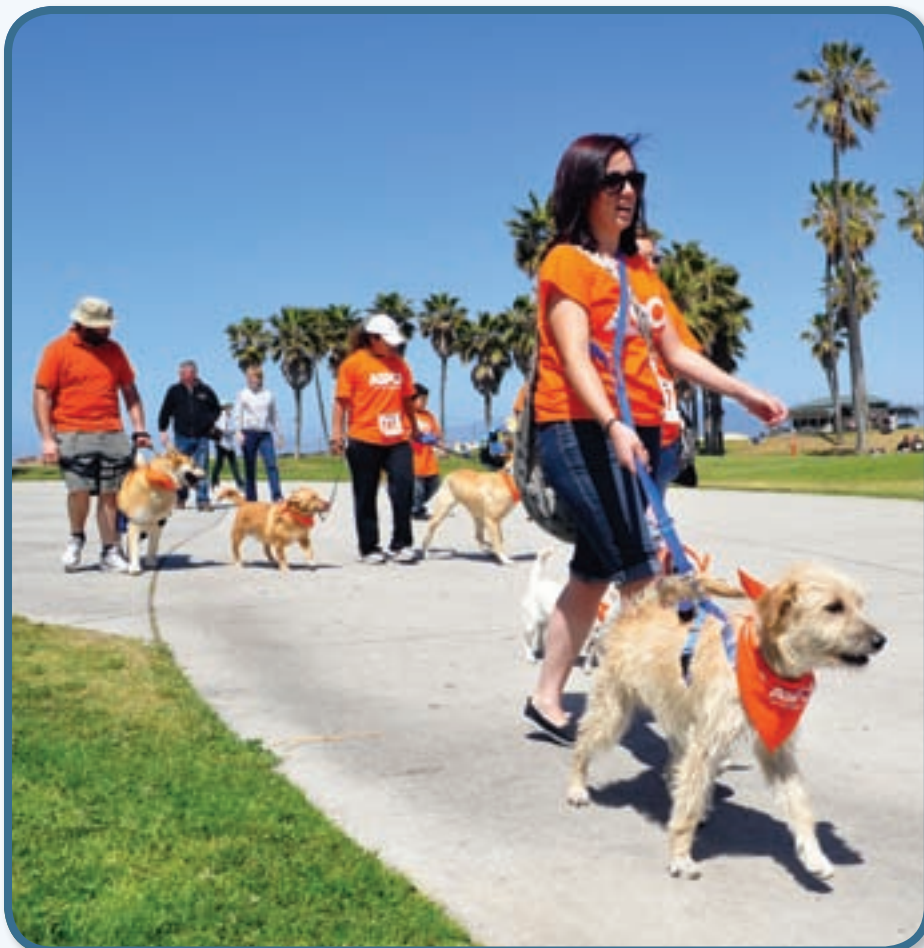
Pups and their proud parents strut their stuff at the Venice Beach, California Wag-n-Walk.

variety of pet-friendly activities. And on April 25, in Venice Beach, California, West Coast animal lovers and their pets joined in a celebration featuring adoptable animals from Bark Avenue Foundation, a Los Angeles rescue group. The fun included a remote broadcast and giveaways from local radio stations KOST-FM and KTLK-AM, free advice from ASPCA experts, refreshments and other festivities. Both the Austin and Venice Beach events also featured the first annual ASPCA “Wag-n-Walks.” Aside from raising awareness, participants in the “Wag-n-Walks” helped raise the necessary funds for the ASPCA and its lifesaving programs.