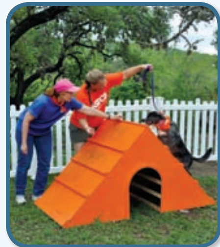
Austin pet parents lead their furry friends through an obstacle course.

ASPCA and Austin ASPCA® Mission: Orange™ partners at Zilker Park. Attendees were treated to a festival that featured adoptable animals from Town Lake Animal Center and the Austin Humane Society, discounted services from emanciPET and Animal Trustees of Austin and offered a