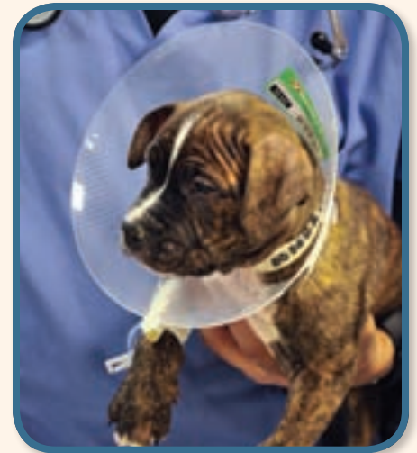
Shelter puppy receiving vital medical care.