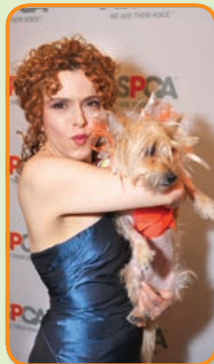
Bernadette Peters with Terrier