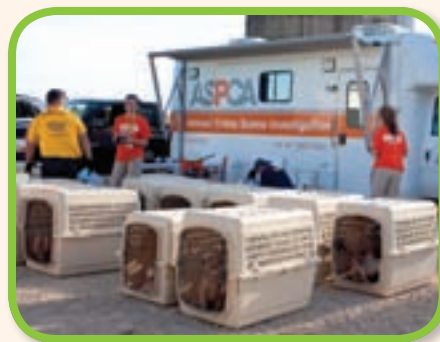
ASPCA teams prepare to evacuate animals from Thyme and Sage Ranch.

state-of-the-art forensics tools and unmatched expertise to collect and process evidence at crime scenes. The specially designed vehicle is also outfitted with medical equipment tailored for animal patients. More than 315 dogs, 21 rabbits, birds, horses, chinchillas and a ferret were removed from the property during the seizure. The ASPCA collected evidence for the prosecution of the criminal case, and it provided the services of a special forensic cruelty investigation team, composed of disaster animal rescuers and field service investigators. More than a dozen responders from the ASPCA Disaster Response Team were on the scene, and were assisted by the American Humane Association and Saranac Technical Rescue Team. Other animal rescue professionals from national organizations, including Humane Society of the United States, United Animal Nations, and Hooved Animal Rescue and Protection Society, as well as local agencies such as Dane County Humane Society, assisted in handling animals on the scene. PetSmart Charities® donated resources and supplies, and Dane County Humane Society provided temporary shelter for the dogs and cats involved in the investigation.