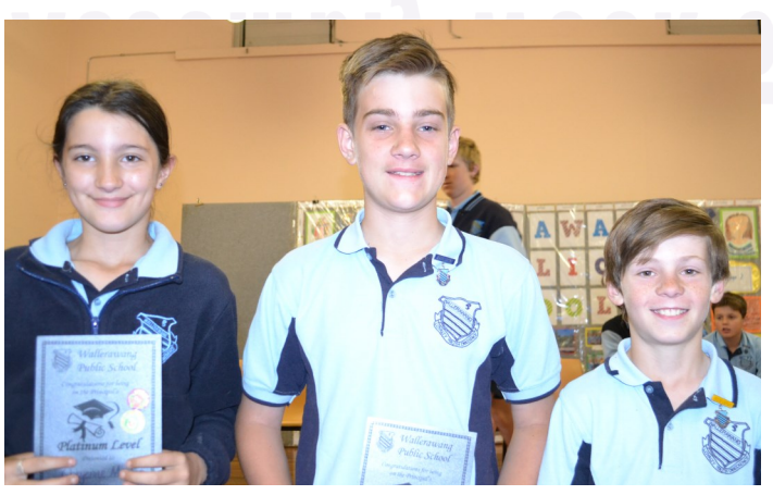
More Assembly photos on page 7