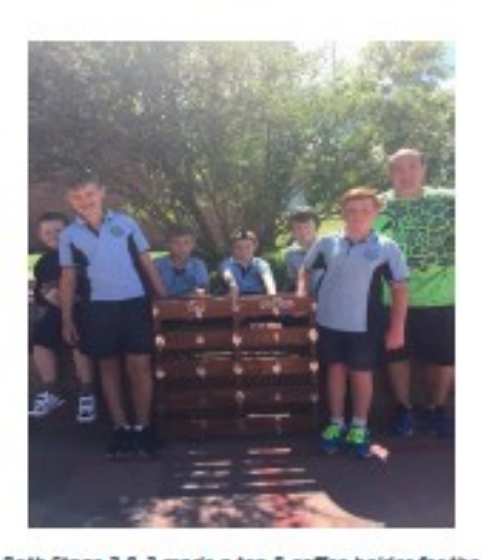
Both Stage 2 & 3 made a tea & coffee holder for the staffroom