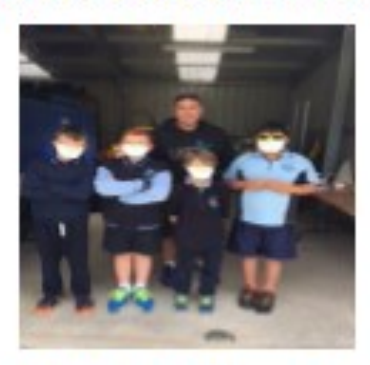
Ready to go with their safety masks and glasses

This term, targeted students in Stage 2 & 3 have been participating in a Life Skills program where they are undertaking woodwork. These students have been engaging in a variety of woodwork skills such as sanding, painting, hammering nails and designing some wonderful creations for themselves and the school. They have been working cooperatively with one another and are to be commended on the hard work they have been doing to complete these fantastic woodwork creations.