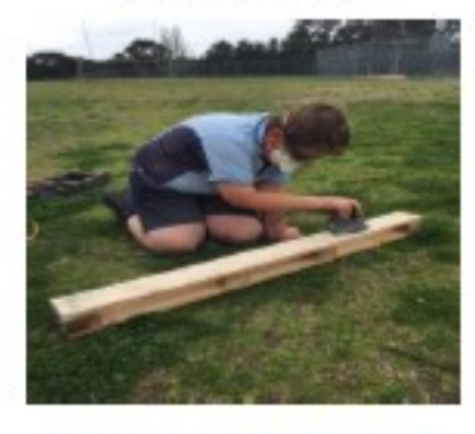
Preston hard at work using the sander