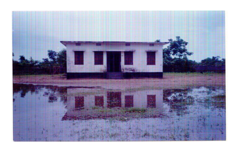
Figure-2: Unhygienic environment around a community clinic