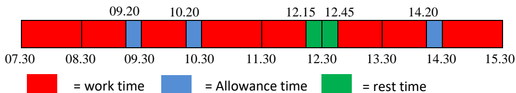
Figure 1 Recommendation of Giving Break Time

The level OCRA Index was affect working time [17] and work posture [14]. In allocating optimal rest periods, the first step that needs to be done is to place lunch breaks. In accordance with Figure 1, the lunch break time for this company is in the time slot j = (5.6) on one shift for eight hours of work. Therefore, it is possible to bring up 10 alternative scheduling of optimal rest time remaining that are acceptable, as in Table 2. However, if it is assumed that work time slots of more than two hours are not allowed and work time slots that last less than 50 minutes also not allowed [11], it can reduce the number of optimal solutions for the resting schedule received to 3, as shown in Table 5.