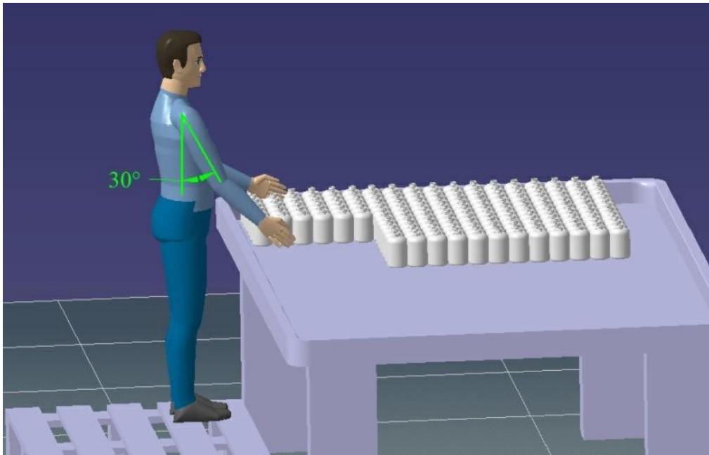
Figure 2 Simulation Arranging bottles with CATIA

The result from the calculation OCRA index after improvement, knowing that there was reducing the number of OCRA index before and after improvement. The highest index is left hand in arranging the dosing cap activity and the lowest index is the right hand in arranging bottles. The classify from OCRA index after improvement showed that the risk had variation from acceptable risk until the high risk.