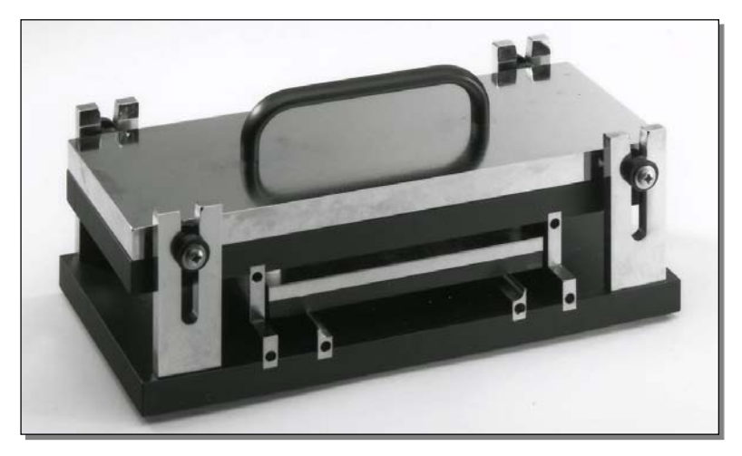
Figure 1.0-1: Model 831 D 991 Test Fixture

The Model 831 D 991 Test Fixture, shown in Figure 1.0-1 is designed specifically to test material in accordance with ASTM D 991 – RUBBER PROPERTY - VOLUME RESISTIVELY OF ELECTRICALLY CONDUCTIVE AND ANTISTATIC PRODUCTS.