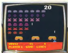
Figure 8 - A Saucer Hit

Throughout the game, enemy command saucers fly overhead on reconnaissance missions. The saucers always cycle once from the left and twice from the right. You can score extra points by shooting the enemy saucers. When you hit one, the point value for that saucer lights up on the screen, as shown in Figure 8.