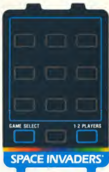
Figure 4 - Keypad Overlay

Press START to begin the invasion. The START key is deactivated while a game is in progress and reactivated after all lives are lost.