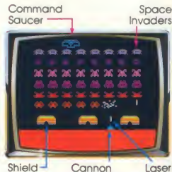
Figure 1 - Typical SPACE INVADERS Screen

You begin each game with three shields. Initially, you are safe behind the shields. But as you and the enemy hit the shields with lasers and bombs, they become damaged, allowing laser beams from your cannon and bombs from the enemy to pass through them. As the space invaders approach the shields on their descent toward you, the shields disappear altogether. Figure 1 shows a typical SPACE INVADERS playfield, with attacking aliens, the command saucer, your laser cannon, and shields.