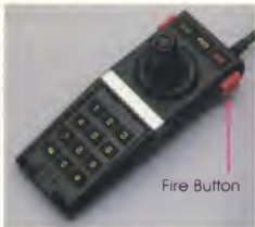
Figure 3 - 5200 Controller

Use one or two 5200 controllers with this ATARI game cartridge. For one-player games, plug the controller into controller jack 1 on your console. For a two-player game, plug the second controller into the number 2 jack. In two-player games, the player using the number 1 jack controls game selection and starts the game. (See Figure 3 .)