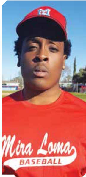
23 Caliph Despanie