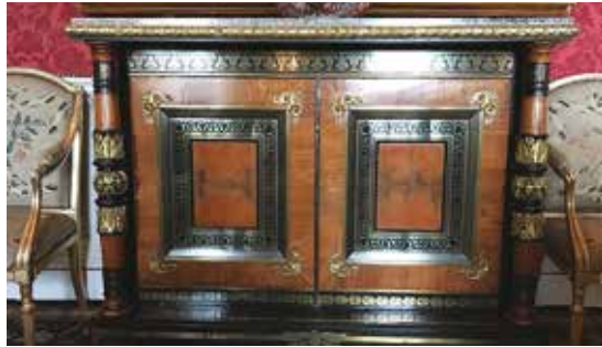
One of a fine set of cabinets from larch and Glen Tilt marble commissioned by the 4th duke from George Bullock in 1817.

The 4th Duke, known as the planting Duke, started planting larch in commercial quantities from about 1800 onwards, with thousands planted near Loch Ordie and Loch Oisnie. In 1817 construction of the frigate "Atholl" commenced in the naval dockyard at Greenwich, as the 4th Duke encouraged the navy to experiment using larch not oak for ship building. The Atholl was launched in 1820 and continued in service until the 1860s. The following year the Brig "Larch" was constructed but wrecked in the Black Sea in 1827. In 1917 the larch trees at Loch Ordie were felled as part of the need to use home grown timber during the First World War. Thus, although the trees were never required for the navy due to the introduction of steel ships, they had an important national use and provided much needed income for the estate. Since then many more larch trees have been planted, ensuring they remain a feature of the Atholl landscape.