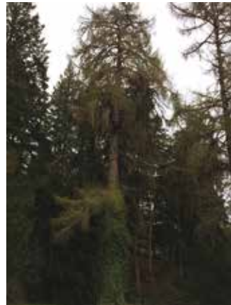
A larch tree planted in 1737 in the castle grounds at the entrance to Diana's Grove.