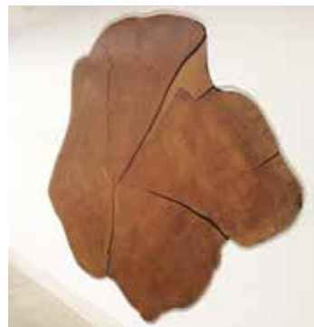
A section of larch from a tree struck by lightning in 1906