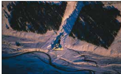
Bruar Lodge (before the hydro scheme was built)