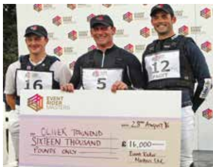
ERM Podium 2016