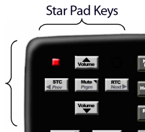
Figure 3 - Quantum Engineer Programming Keys