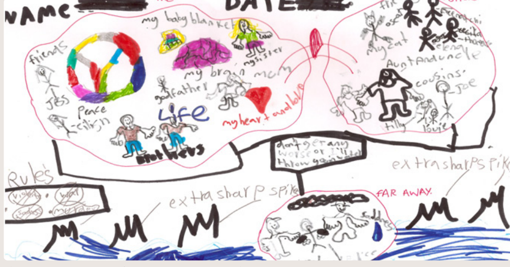
Figure 5.1 An example of the Three Islands technique

Read more about the Three Islands technique (as well as the Three Houses tool and the Faces technique) here: www.communitycare. co.uk/2011/11/07/social-work-tools-for-directwork-with-children-drawing