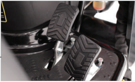
Switch seamlessly between forward and reverse with two side-by-side hydrostatic transmission pedals.