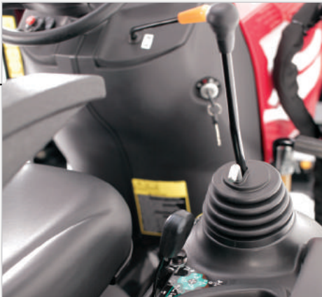
Work comfortably with armrest-mounted loader control lever, while True Position Control lever (below joystick) delivers precise operating height of rear implements.