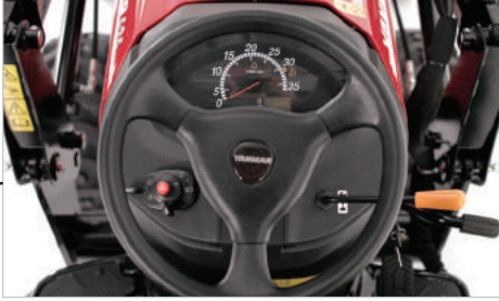
Simple to operate; easy access to every control.