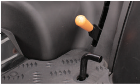
Differential lock is standard with foot pedal engagement for SA324 and SA424.