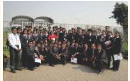
RANE MADRAS, CHENNAI