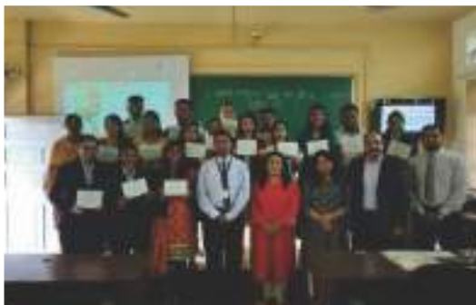
WORKSHOP ON VIDEO RESUME