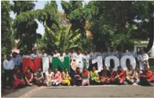
VISIT TO NIN, HYDERABAD