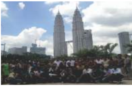
INTERNATIONAL TOUR TO MALAYSIA