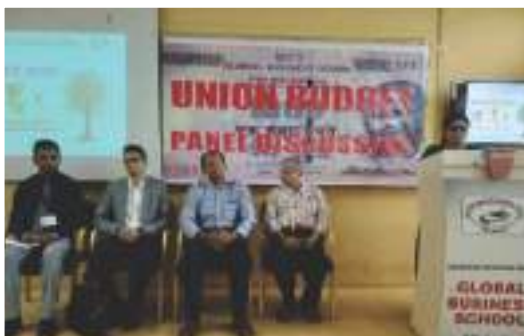
PANEL DISCUSSION ON UNION BUDGET