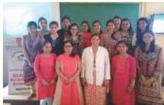
WORKSHOP ON HEALTH & HYGIENE