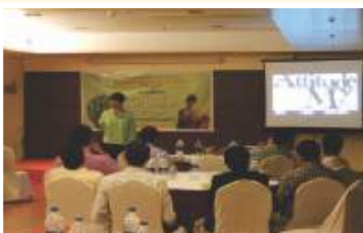
WORKSHOP ON ENTREPRENEURSHIP