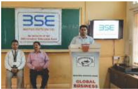
SEMINAR BY BSE ON INVESTMENTS