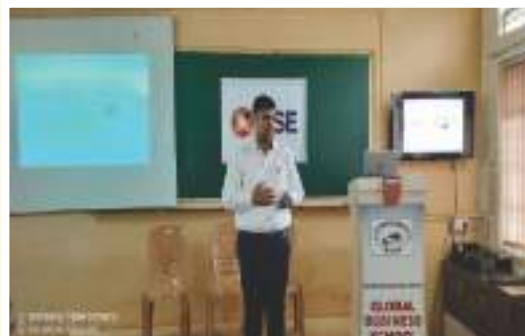
NSE WORKSHOP ON MUTUAL FUNDS