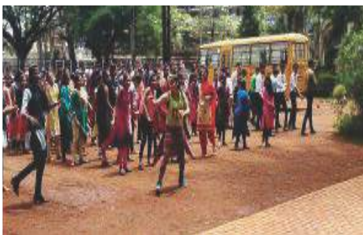
FIT INDIA MOVEMENT