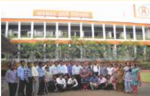
VISIT TO M&M, KOLHAPUR