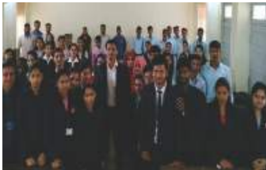
WORKSHOP ON GOAL SETTING