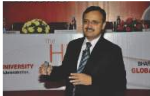
NATIONAL MGMT CONCLAVE