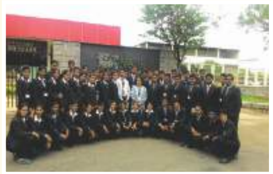
NESTLE INDIA, MYSORE