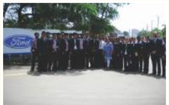
FORD INDIA, CHENNAI