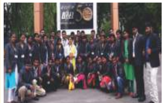
BHEL LTD., HYDERABAD