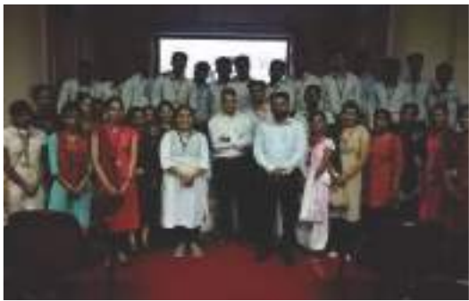
VISIT TO ISB, HYDERABAD