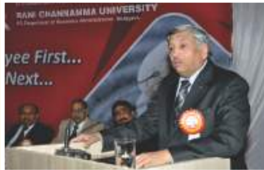
NATIONAL HR CONCLAVE