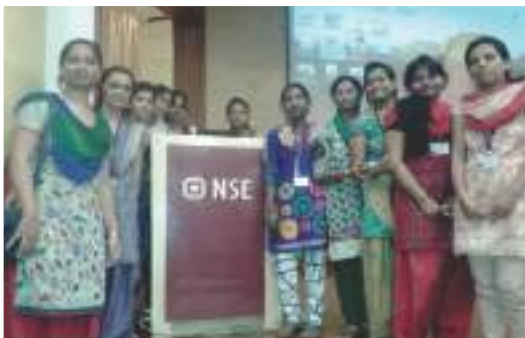
VISIT TO NSE, MUMBAI