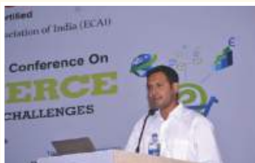
NATIONAL CONFERENCE ON E-COMMERCE