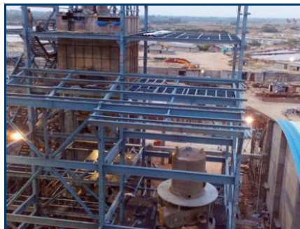
Synthetic Iron Oxide Pigment Project