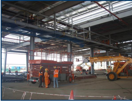
Utility Piping Project