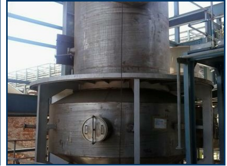
Synthetic Iron Oxide Pigment Project