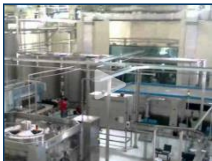
Brewery PET Bottling Plant Project