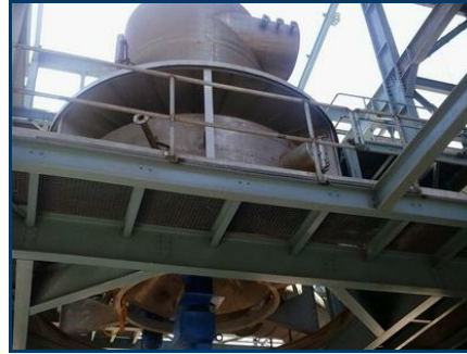
Synthetic Iron Oxide Pigment Project