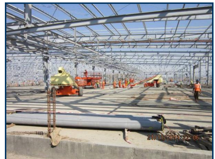
Utility Piping Project