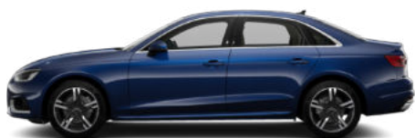
Navarra Blue Metallic 2D2D €1,273