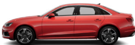
Tango Red Metallic Y1Y1 €1,273