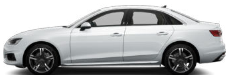
Glacier White Metallic 2Y2Y €1,273