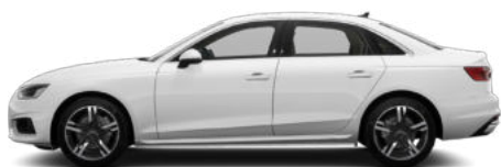
Ibis White Solid T9T9 €0