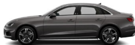
Terra Grey Metallic Z8Z8 €1,273