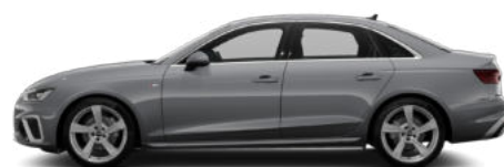
Quantum Grey Solid 5J5J* €1,294