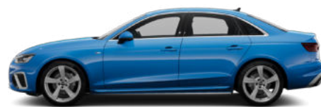
Turbo Blue Solid N6N6* €1,294