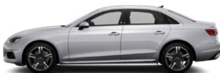
Floret Silver Metallic L5L5** €1,273