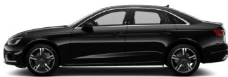
Brilliant Black Solid A2A2 €0