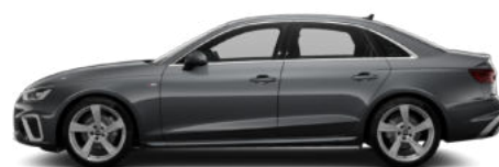
Daytona Grey Pearl Effect 6Y6Y* €1,294