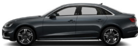
Manhattan Grey Metallic H1H1** €1,273