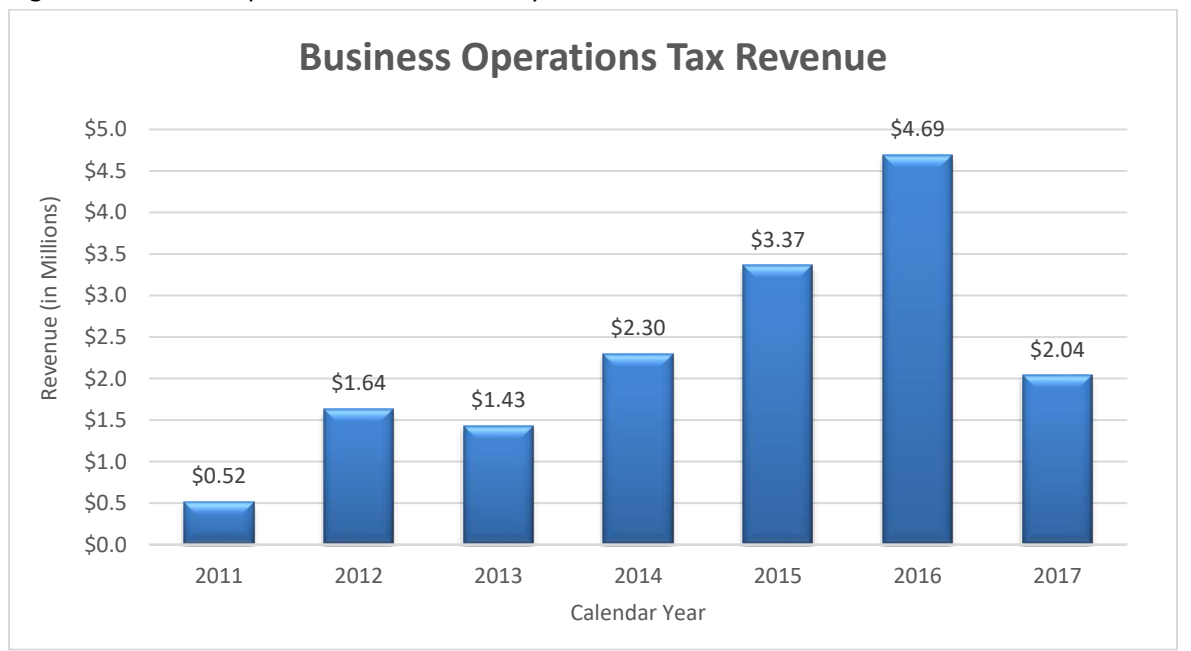
Figure 5: Business Operation Tax Revenue by Calendar Year

Medical marijuana dispensary BOT revenues are deposited into the City's General Fund. BizLINK is the software system used to track the dispensaries' reported gross receipts and the BOT payments made to the City. The figure below shows the total BOT revenue remitted by dispensaries since July 2011, by calendar year. Federal enforcement caused several dispensaries to close and may have contributed to the decrease in revenue from 2012 to 2013. The medical marijuana dispensary tax revenue increased year over year between 2013 to 2016 and is projected to increase further in 2017.