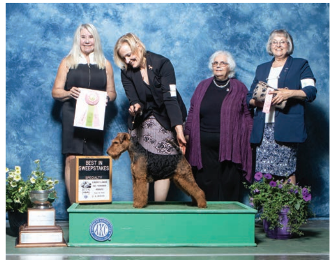
BSW: Brynmawr Scallywag.