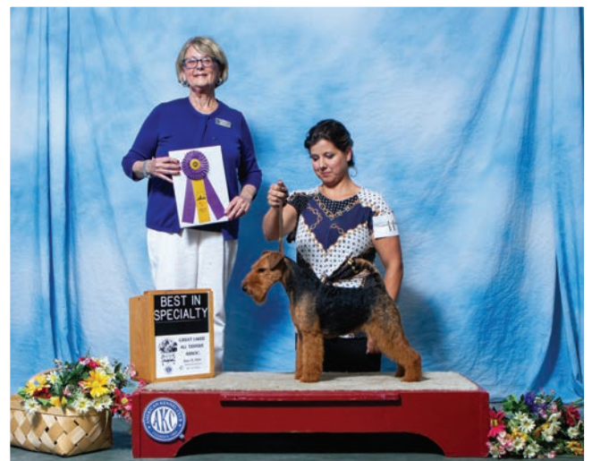
BOB: CH Hiwater Steuer's Eye Of The Storm.