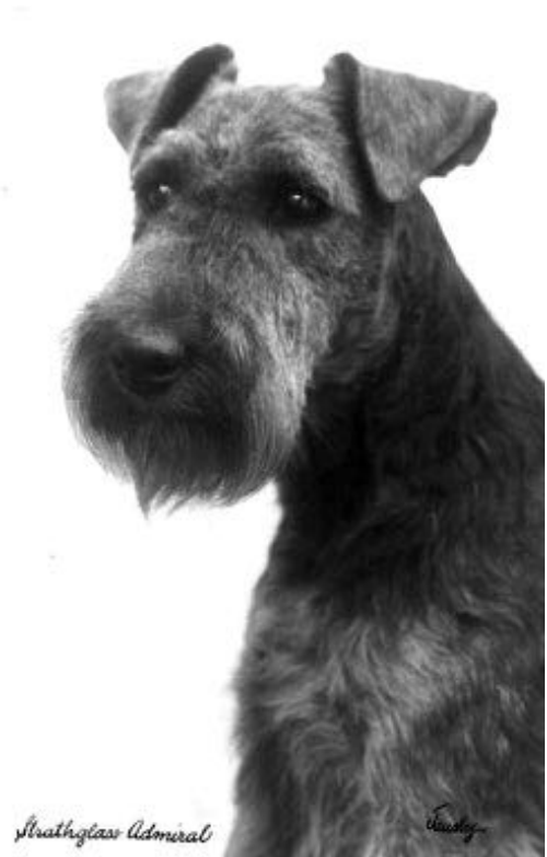
Old School: Welsh Terrier Ch. Strathglass Admiral

Most Welsh have a great sense of smell and respond to the odor of the treats more than the taste. If your Welsh is not one of these, you might want to test his sense of smell. A sinus infection can reduce or remove all sense of smell for a long time. With a dog like that you may have to use some other treat or motivation. If you know a Bulldog breeder, you might ask what treats their dogs respond to, as that breed is not known for a sensitive sense of smell.