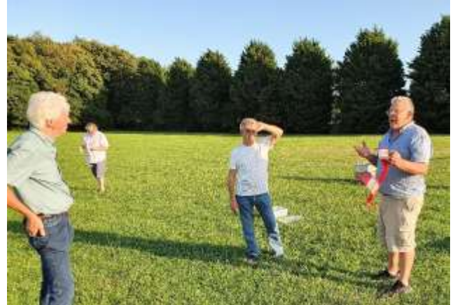
The "Captain" holds forth....