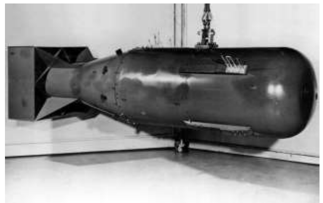
Answer at the end of the newsletter.....