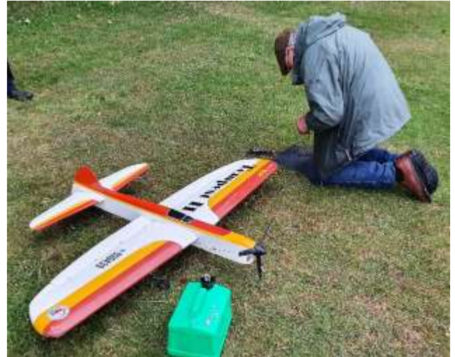
John prays before flying his Tempest. This model is powered by the Stalker 66 – an 11.5cc Ukrainian engine and flies very nicely.

Control Liners seem to cope with the wind very well – no FF flyers dared to brave the inclement elements!!