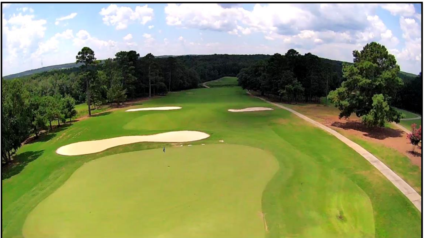
Drone Image of #9