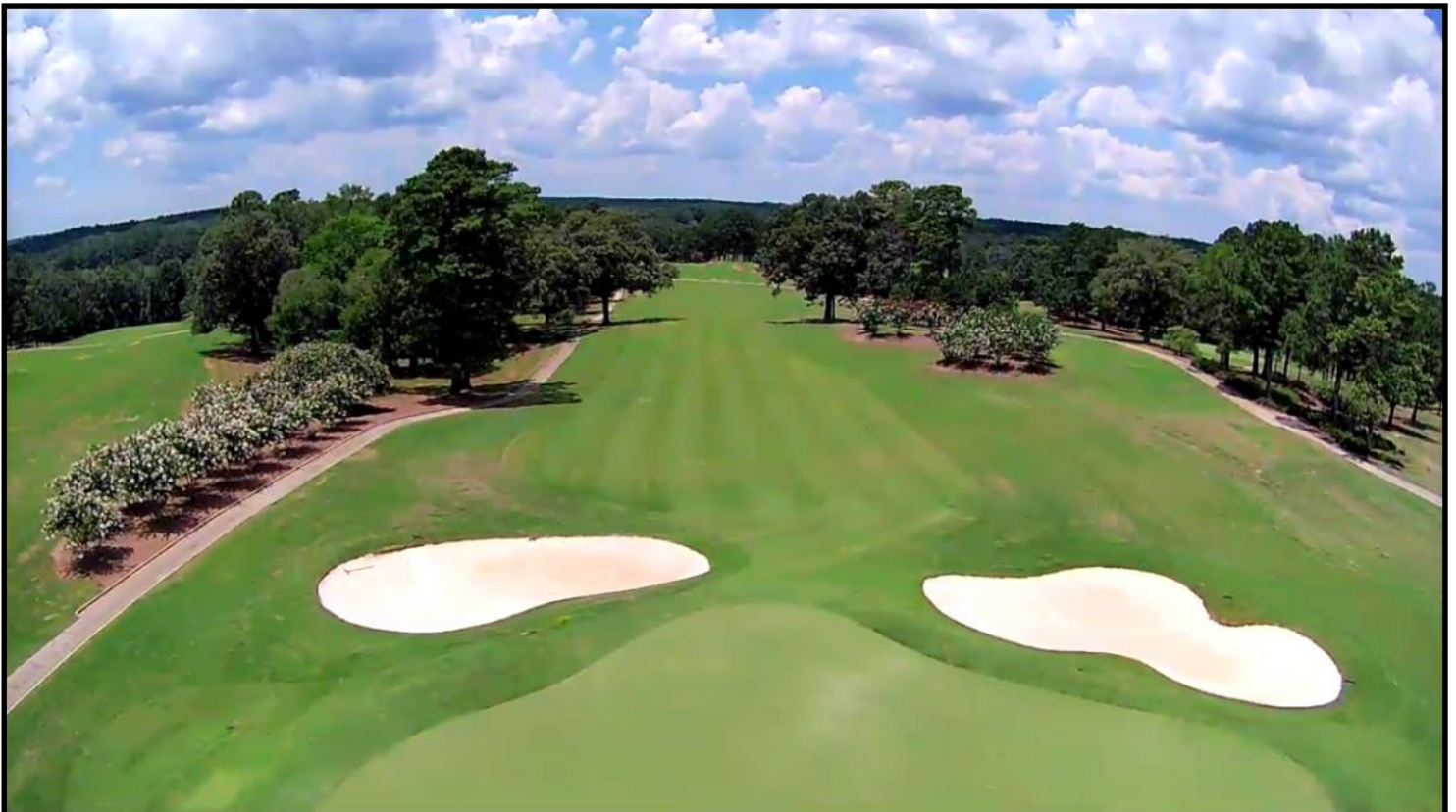
Drone Image Hole #18