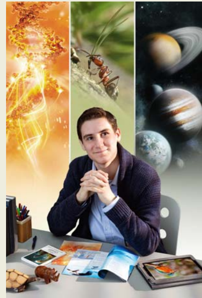
Ant Photo: © CSP Anterovium/age fotostock

“Was It Designed?” series in Awake! and on jw.org