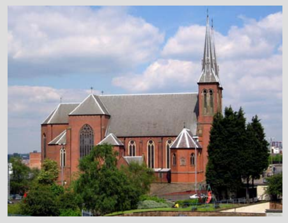
St. Chad's 1839, Cathedral