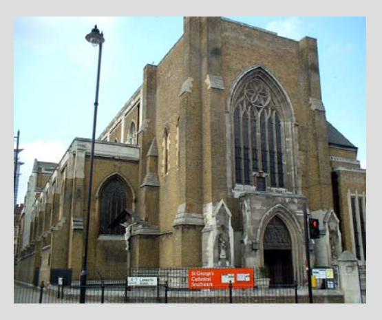
St. George's Cathedral 1839, Cathedral