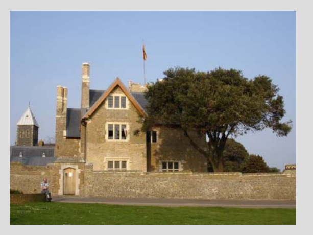
St. Augustine's Grange 1843, Residential